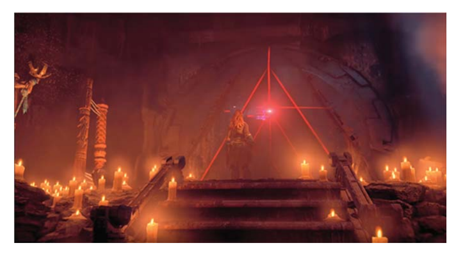
Figure 9. Aloy in front of an activated "All-Mother"—a glorified, but artificially intelligent door lock.

Both the All-Mother and HADES, then, are confused for wise, utopian agents, even though their goals are clear and their algorithms do not encompass more than that. HADES is the "extinction failsafe protocol" for GAIA, the head AI charged with repopulation; the All-Mother is the Nora's name for GAIA's digital door-guard. Machines and extremely intelligent AI have thus become so incomprehensible for 31st-century humans that they are considered to be gods and goddesses and are worshipped with utter devotion.