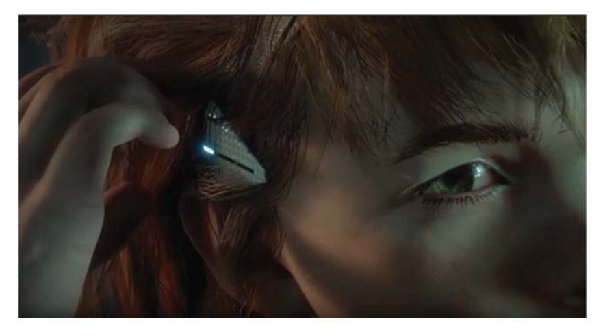
Figure 13. Aloy as a child with her "Focus" (the little triangular device above her ear).