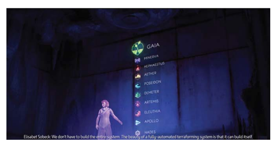
Figure 10. GAIA and her subsystems named after Greek gods and goddesses, and one Roman goddess.

The religious metaphor already comes to the fore in the names given to GAIA's subsystems, all based on the names of ancient Greek gods and goddesses (Figure 10; Table 1): APOLLO, DEMETER, POSEIDON, and so on. Additionally, it is evident in their functions. For instance, in the mission 'The Heart of the Nora' the player and Aloy discover that after the apocalypse, humanity was recreated by one of GAIA's subsystems and machines in cradle facilities called ELEUTHIA, after the Greek goddess of childbirth and midwifery. In these facilities the genetic codes of the Old Ones are preserved and used to breed new human beings. The machines are programmed in such a way that they can nurture these new humans into fully-grown adults that are able to procreate themselves and the facilities are equipped with anything needed to sustain these new human beings ranging from food, toys, and even an internal educational system called APOLLO that was supposed to teach humans everything about the extinct civilization (Figures 11 and 12).