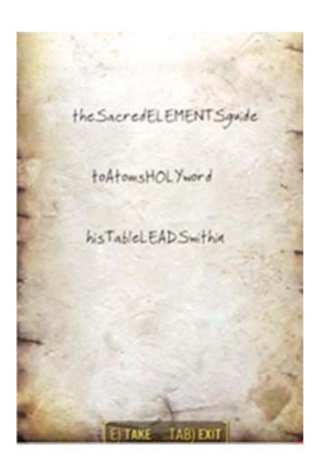
Figure 5. The scroll that guides believers to Atom's "HOLY word."

In the Far Harbor DLC, players can join the church after completing a quest that resembles an initiation ritual, to seek the "Sacred ELEMENTS, guide to Atom's HOLY word" (Figure 5), which turns out to be the Periodic Table (Figure 6). Upon doing so, players meet The Mother of the Fog, the Children's spirit leader sent from Atom to guide them. The MoThEr (Figure 7) spirit is the figure shrouded in mist (atomic glow) who passes down Atom's will and guides the player to the periodic table, their Bible.