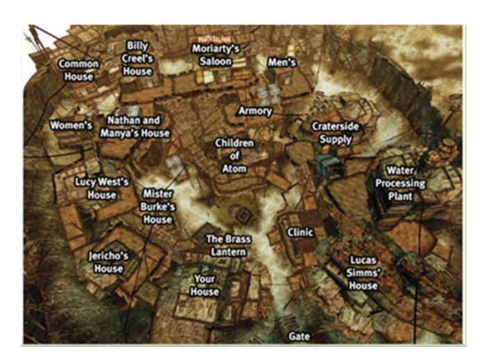
Figure 2. Megaton's map (Fallout Wikia n.d.).

Fallout 3 presents a world in which the near-complete destruction of human civilization means that most scientific and traditional institutions have disappeared. After the apocalypse, the raw power of nuclear energy can only be understood as phenomenal. Additionally, the disappearance of any necessary knowledge of nuclear power—most appliances from before the apocalypse still work—makes it into a magical, incomprehensible power. Its destructive potential can only be imagined, while its altering effect on mutated humans and animals can still be seen. While the Church of the