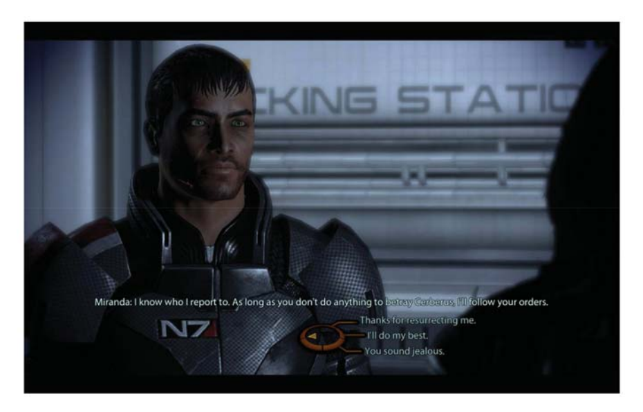
Figure 2. Dialog in Mass Effect 2<sup>16</sup>.

Dialogues play a central role in the Mass Effect series and are used as the main means of continuing the story arc. A so-called "dialogue wheel" is used, in which the player can select the general tendency of the answers to be given—but not their exact wording (see Figure 2).