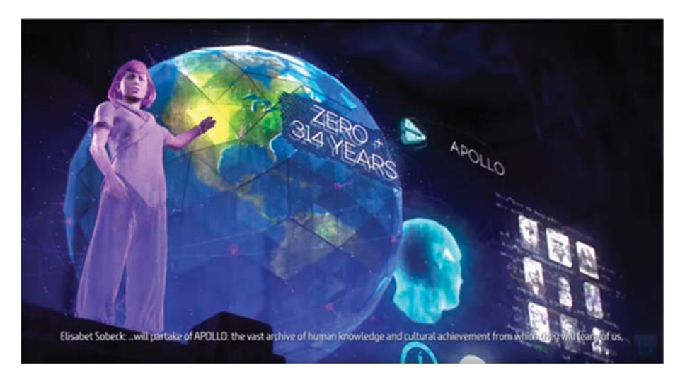
Figure 12. A hologram explains the educational APOLLO archive.

of Aloy's body and the technological projections of the 'focus'. A Focus is a small augmented reality device that Aloy finds at the beginning of the game, which can provide wearers with a multi-purpose 3D neural interface and communication possibilities (Figure 13). These small devices were developed by the Old Ones to simplify interactions between humans, and with machines, technology. They react to the voice and gestures of the person using the device—much like a fictionalized Google Glass. In one of the first playable parts of the game, Aloy finds a Focus in the ruins of what once used to be a workplace or bunker of the Old Ones. This little device is then used by Aloy and the player to discover relevant and interesting objects in the game environment, to scan documents and holograms left by the Old Ones, and to distinguish between friends and foes. However, as these ruins are considered to be cursed by the Nora, the little device is also seen as something dangerous. On the other hand, among the Eclipse, the Focuses have a divine connotation as these are given to them by HADES and the devices allow them to communicate with each other, as well as directly with HADES.