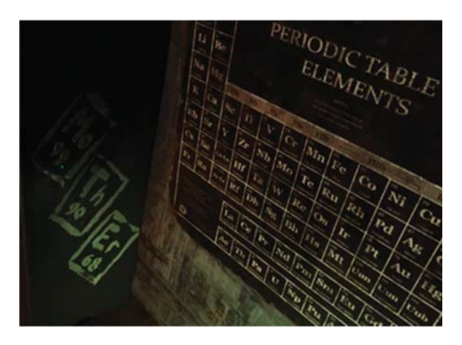
Figure 6. The Periodic Table that serves as the holy text of the Church of the Children of Atom.

a religion around an undetonated nuclear bomb (in Fallout 3 ) and later by expanding church sites to irradiated lands ( Fallout 4 ). In its reverence of atomic power, exemplified through the glorification of the periodic table, ideas of division and theories of atoms found "within" everything, the Church presents a parody of a contemporary 'science—religion' divide in popular culture. Even its direct contrast, the religion of the Treeminders, which opposes the Children of Atom thematically (revering nature instead of science), should be seen as a way of dealing with the consequences of man-made nuclear fall-out through religious metaphors. Both, importantly, appear possible only against the background of the total erasure of previous historical religious institutions.