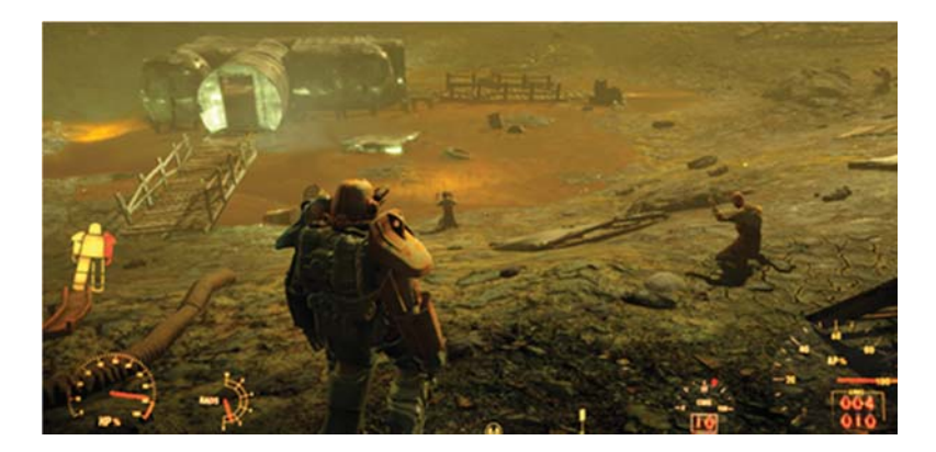
Figure 4. Atom's place of worship, next to a radiated water crater, in the Glowing Sea.

That is our calling. To deliver Atom's message to a world that does not wish to hear it. To show Atom's power to all."