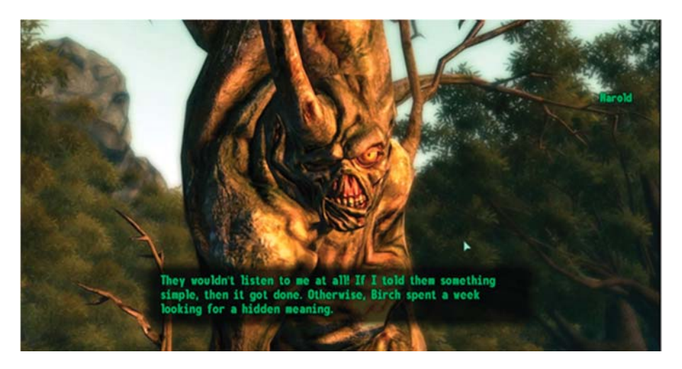
Figure 3. Harold, The One Who Grows, Gives and Guides, talking to the player.

As opposed to Atom, the Treeminders deify nature, embodied in the shape of 'The Great One,' a talking tree. The Great One—or as he's also called The Lord, Him, The One Who Grows, Gives, and Guides, and The Talking Tree, or simply Harold – is the product of a retrovirus exposure that was supposed to create resistance to radiation but instead created mutated humans. The retrovirus' effect on Harold is that a tree started growing out of him until he became one with it (Figure 3).