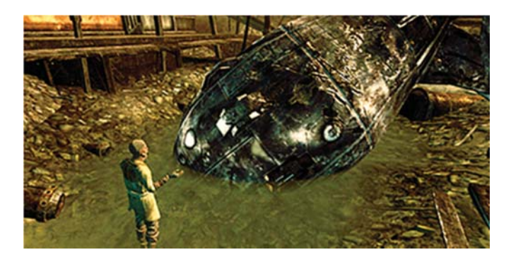
Figure 1. Confessor Cromwell preaching and praying next to the atom bomb.

Here, Atom is said to come and divide our cells, ending our earthly suffering. Atom is present anywhere, from the "infinite worlds" inside our every cell, to the huge radiation storms, powerful ecological consequences of the nuclear fallout that plagues the wasteland. Thus, the Church was created and fortified in Megaton where its first settlers took shelter in the crater in the 23rd century—and it has spread across the United States since then, as the appearance of the Church attests to in various places in Fallout 4 , which takes place barely 10 years later.