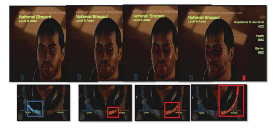
Figure 5. Scar development in relation to the "Renegade" value.

If the "Renegade" value is high, the appearance of the player character can change drastically and give Shepard a very gloomy, perhaps even "inhuman" look, with the change taking place gradually and not fluently (see Figure 5).