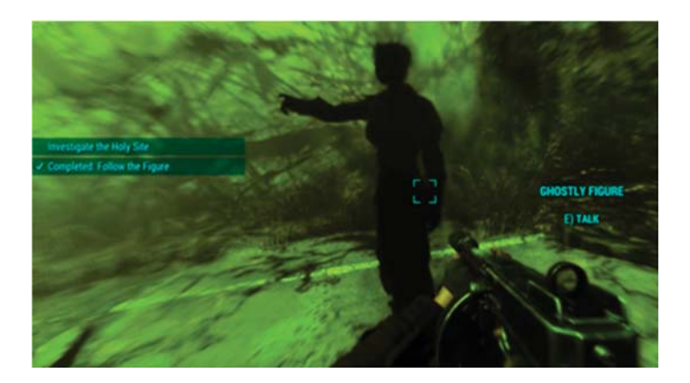
Figure 7. The MoThEr aids the player in their quest to become a member of the Church of the Children of Atom.