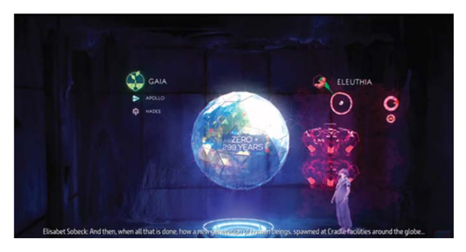
Figure 11. A hologram explains to Aloy and the player how cradle facilities (ELEUTHIA) work.

Yet, AI and machines are not only capable of assembling human beings and recreating the biosphere. Even before the apocalypse, the AI of machines was developed enough to learn how to make themselves more powerful and how to "procreate." As these systems were developed without a