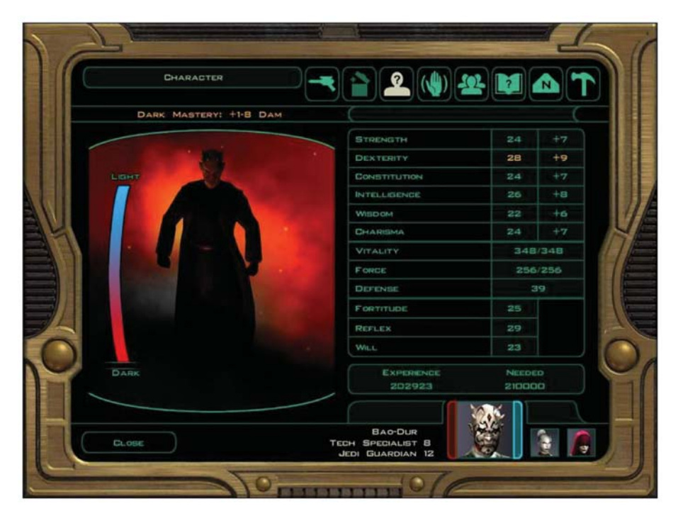
Figure 1. "Alignment" Bar<sup>11</sup>.

The decision is then evaluated by the game and is reflected in a scale that can be viewed at any time and ranges from 'Dark' to 'Light' (see Figure 1).