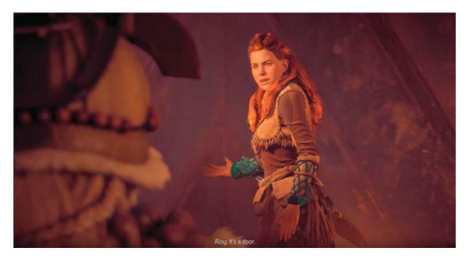
Figure 8. Aloy tries to explain to a matriarch that All-Mother is actually a door.