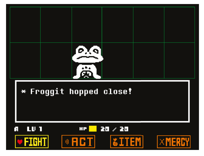
Figure 1. A screenshot from Undertale showing the first random encounter of the game, in which a "Froggit" "hops close" (note that aggression is implied via the convention of a random encounter but not by the text). The options are "fight," "act," "item," and "mercy," the last of which is unconventional.

different skill levels would also be an interesting approach, we consider here the perspective of players that have no trouble with the challenges involved in either attacking or pacifying the enemies.