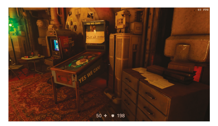
Figure 5. The in-game arcade with the "Wolfstone 3D" and "Yes We Can!" machines.

A final procedural statement connected to the "Wolfstone 3D" arcade machine is that it is located in the headquarters of the Kreisau Circle, right next to an allied entertainment machine, a pinball with the name "Yes we can!" This machine is, however, out of order, creating another, this time extremely game-specific, commentary on contemporary politics: The machine named after the political leitmotif of the Obama-era is no longer accessible, cannot be engaged with anymore, and all that remains is a historically revisionist arcade-shooter that draws us in with its technological achievement and graphical fidelity to make the player feel immersed, while ignoring the dubious political message (see Figure 5). MachineGames' use of an arcade as a metaphor for the shift in the American political landscape between the Obama and Trump administrations, hidden in plain sight in the middle of a mainstream digital game, is a perfectly elegant display of game design mastery.