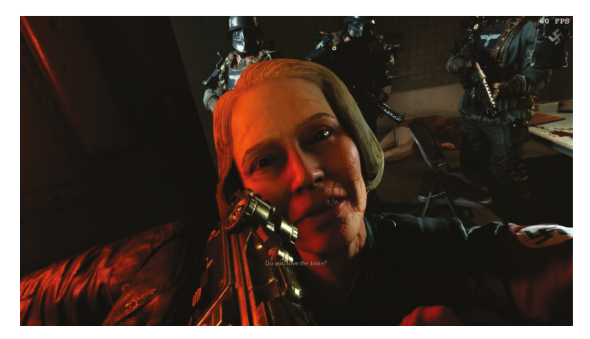
Figure 4. Irene Engel's sexually charged assault on BJ Blazkowicz.