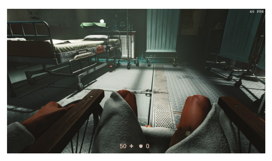
Figure 3. Hero in wheelchair, bathrobe, and catheter.

The decision to start the game by depriving BJ Blazkowicz of his able-bodiedness is more than a gameplay twist on FPS conventions (which I discuss in the next section), it caricatures the promise of improvement and perfectibility implicit in the standardized alternative corporeality of hardcore games. Instead of offering the player an avatar who is better than them in basically every way and can act as a foil for projections of masculine power fantasies, The New Colossus re-contextualizes BJs body in the alternative corporeality of disability. Disability studies emphasizes "the active transformation of life that the alternative corporealities of disability creatively entail" (Mitchell and Snyder 2015, p. 2), i.e., the ingenuity and tenacity it takes to navigate a society built upon implicit standards of able-bodiedness (Siebers 2008). It would be naive to assume that putting BJ in a wheelchair was a realistic simulation of disability, but it does not have to be; it radically runs counter to the player expectations of an FPS avatar body as hyper-able and lets players experience being in a physical environment that does not accommodate one's corporeality.