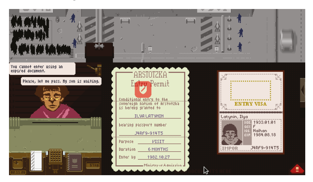
Figure 2. A screenshot from Papers, Please showing the interface as the player decides whether to admit a traveler. The traveler in question previously stated that she was coming to visit her son, who she has not seen in 6 years. Although her entry permit is slightly out-of-date, she is asking for leniency. At this point, the player must decide to either approve or deny her visa.

decision is complicated by the fact that the game also presents situations where applicants attempt to bribe or threaten the player, implying that not all of their claims can be taken at face value. This decision about the fate of an ostensible refugee (or similar person) embodies one of the central themes of the game: how the uncertainty of information from unreliable sources can be pitted against the certain plight of one's family to turn a moral dilemma into a choice with a reluctant "better" option. In the rest of this section, we show the results of each step of a choice poetic analysis (see Section 1) for the choice described in Figure 2.