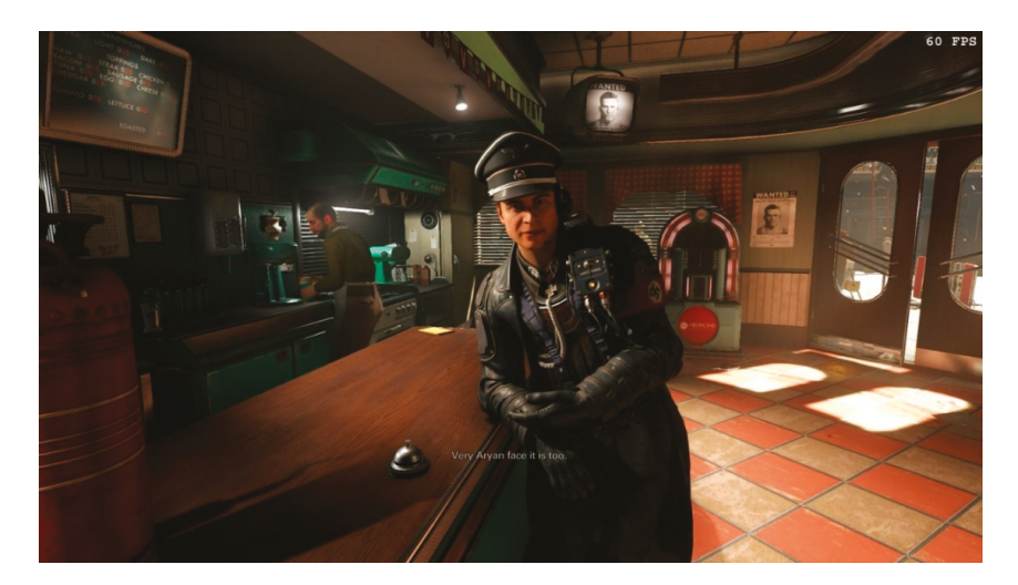
Figure 2. A Nazi officer complimenting the player character upon his Aryan facial features.