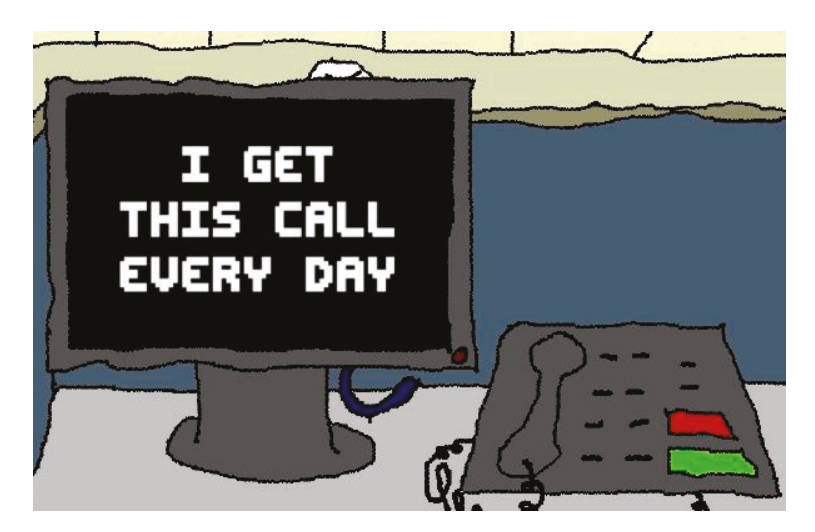
Figure 2. The opening screen for I Get This Call Every Day places the player in a first-person perspective at a call desk.

Depression Quest, like many games that explore lived human experiences, is focused on a particular hardship. In it, the player assumes the role of a depressed twentysomething. The game offers players frustration, recognition, and reassurance. If the player makes choices that help the character to improve their life, more pleasant options and scenarios emerge. If the players' choices result in the character's options becoming more limited, those unavailable options will be shown struck through in red (see Figure 3). The game has a soundtrack of faint atmospheric music in a minor key. As the character becomes more depressed, the images embedded in the game become more and more obscured by static; if the character becomes less depressed, the images grow clearer. Through these mechanics and through stylistic and narrative choices, the game seeks to provide a bit of experiential knowledge of depression for players. When the game was released, blog posts and articles often recounted the extent to which players used the game to recognize depression in themselves or work out a path towards treatment (Klepek 2015).