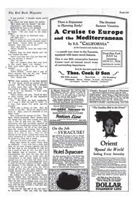
Figure 5. "The Rich Boy" as it first appeared in the February 1926 issue of Red Book Magazine (Fitzgerald 1926b), p. 125.

Like the previous example, the presence of nostalgic dichotomies and tropes found in this advertisement seems to echo the nostalgic mood of Fitzgerald's text. The next advertisements (Figure 5) are not particularly nostalgic, but they also seem to mirror some events in the text.