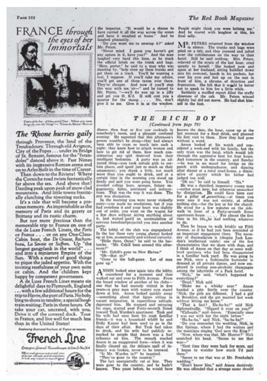
Figure 3. "The Rich Boy" as it first appeared in the February 1926 issue of Red Book Magazine (Fitzgerald 1926b), p. 122.

This part of Fitzgerald's text is especially nostalgic—nostalgic art and art about nostalgia—and sees Anson's depression rapidly unraveling. The previous page ended with Anson displaying restlessness after his last close friend's wedding: "'Go where?' he asked himself" (p. 33). This question is followed by a long passage of remembrance of younger days that continues into the next page: "The Yale Club, of course; bridge until dinner, then four or five cocktails in somebody's room and a pleasant confused evening... A party was a well adjusted thing—you took certain girls to certain places and spent just so much on their amusement... and at a certain time in the morning you stood up and said you were going home" (p. 34). Stylistic devices emphasize the nostalgia evoked in this passage: Iterative frequency, which relates an event as if it occurred several times before, is a "summarizing form" that brings out the nostalgic aspect of memory as "it lacks the specificity of memory and embraces the vagueness of nostalgic memory" (Salmose 2012, p. 202). Polysyndetons, which occur when conjunctions such as "and" and "or" are repeated in close succession, are also present in the passage and form part of Salmose's classification of nostalgic strategies in how they rhythmically mark clock time (p. 190).