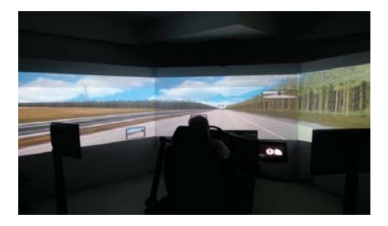
Figure 1. The driving simulator's environment.

Driving Simulator «Virage VS500M» (Virage Simulation, Canada) features advanced simulation software and uses a sophisticated driving environment with real auto parts to provide a realistic feel in all functions. Driving Simulator's environment appears in Figure 1.