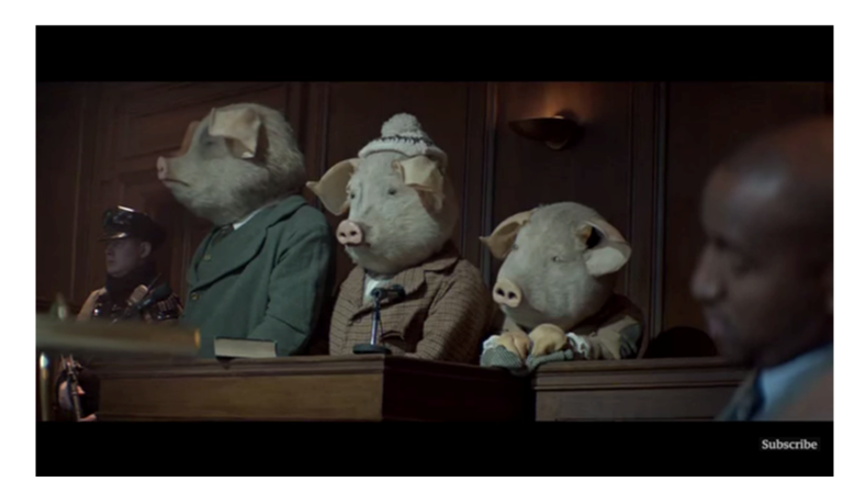
Figure 22. 2010s Three Little Pigs The Guardian Commercial.