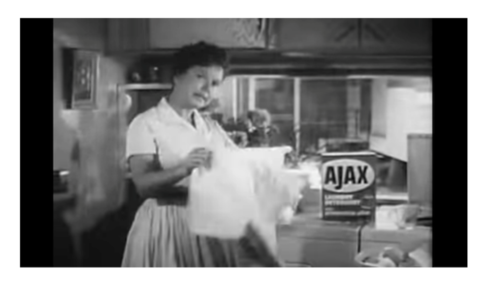
Figure 4. 1960s Ajax Soap Commercial.

Next, let's take a look at an advertisement that attempts to blend humor with a fairy tale figure. This time it's the Fairy Godmother, breaking the fourth wall to publicize a prize giveaway from Crest in connection with the 1965 television broadcast of Rodgers and Hammerstein's Cinderella (See Figure 5).