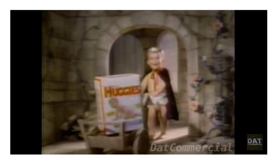
Figure 10. 1980s Sleeping Beauty Huggies Commercial.