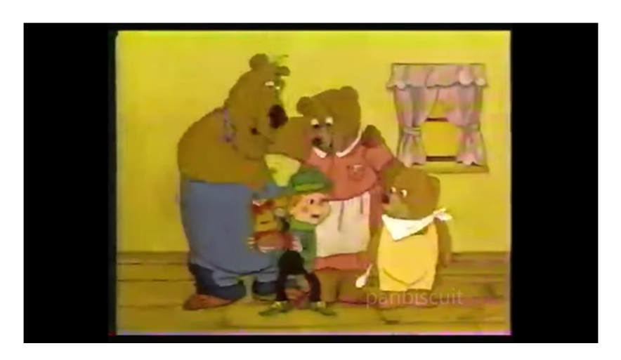
Figure 11. 1980s Three Bears Lucky Charms Commercial.

The bears, from Goldilocks' story though she is absent here, don't show up till the commercial is halfway done and they are never even named. And saddest of all they are summoned into existence by the magic of the cereal pitchman and only speak to talk about everything they love about Lucky Charms. Their entire role in the commercial is to exist only to sell happiness through products. Again, fairy tale figures aren't the only ones being mistreated and achingly marginalized in their own commercials. Just check out the way Roger Rabbit is used in this commercial for Diet Coke and how Slimmer, of Ghostbusters fame, became the face of a new Hi-C flavor. This isn't the first time this instance of slim traces of originality gave way to