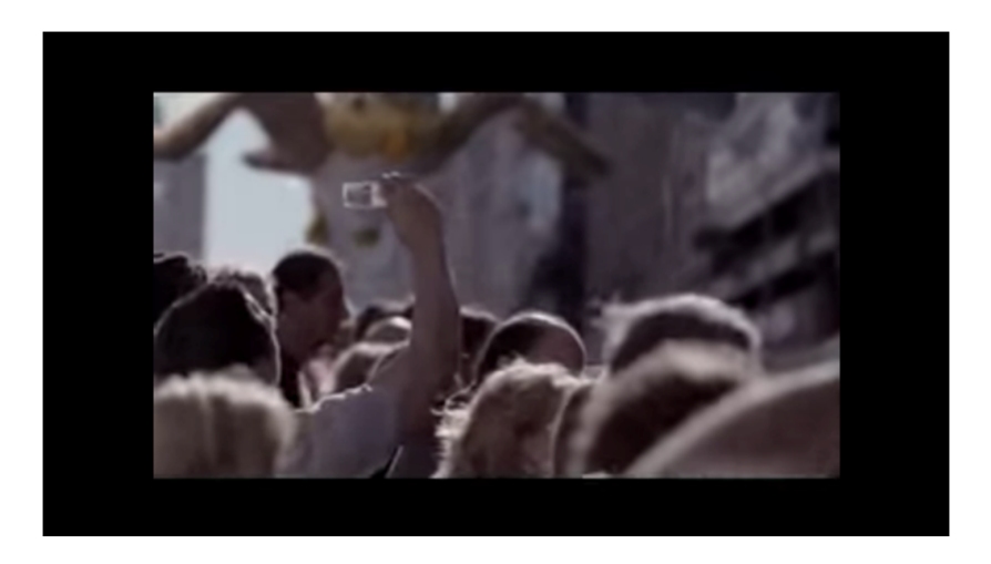
Figure 15. 2000s General Fairy Tale Nokia Commercial.

having in-home internet access [9,10]. Cell phone popularity surged as well, fueled by advances in text messaging and mobile internet accessibility. In a very real way the world was changing. These sudden changes didn't come out of thin air—they had to be sold. And once again advertisers turned to fairy tale iconography to sell these new technologies. Using fairy tale stories to sell these innovative products was a natural fit, as Jack Zipes describes in his Oxford Companion, "basic fairy-tale elements like magic, transformation, and happy endings lend themselves perfectly to the advertiser's pitch that the feature product will miraculously change the viewer's life for the better. Products act as magic helpers who assist the heroes and heroines of the mini-fairy tale overcome whatever dilemma they face" ([8], p. 610). Cell phone commercials flooded the airwaves and haven't left since. Fairy tale types like Hansel & Gretel and Cinderella were inserted into commercials for AT&T and Cingular Wireless to explain their miraculous features and to humanize the gadgets. And one particular commercial from Nokia went long by comparing their phones to all the different kinds of magic in the fairy tale realm (See Figure 15).