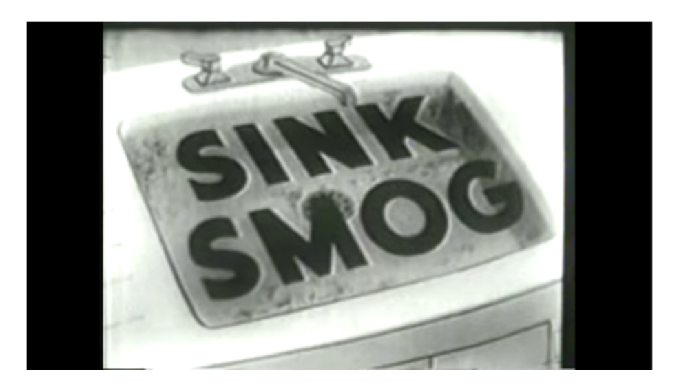
Figure 1. 1950s Bab-O Sink Smog Commercial.

When this migration of cartoons to TV finally occurred during the 1950s, a taxonomy of commercials was established. Commercials had an average length of 1 min and were typically animated. They featured jingles (usually full, original songs) and a steady stream of declarative information about the products and the stories used to tell them. And so we come to the first few commercials that quickly turned to familiar fairy tale iconography. (See Figure 1)