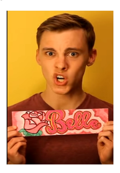
Figure 4. Cozart-as-Belle. [15]

Frame 4 diminishes and the third enlarges: Cozart-as-Belle ( Beauty and the Beast , 1992) is taunted by the Cozarts in the three minimized frames (Figure 4) [20]. Belle sings to the opening song of the movie ("Belle") and tells the audience: