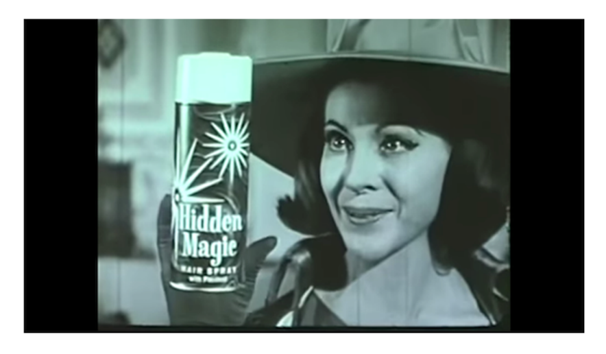
Figure 6. 1960s Wanda the Witch Hidden Magic Hair Spray Commercial.

It would be misleading to say that all or even most commercials of the 60s strove for artistry over clarity or suggestion over description. Take for example this ad for Hidden Magic hair spray starring Wanda the Wonderful Witch (See Figure 6).