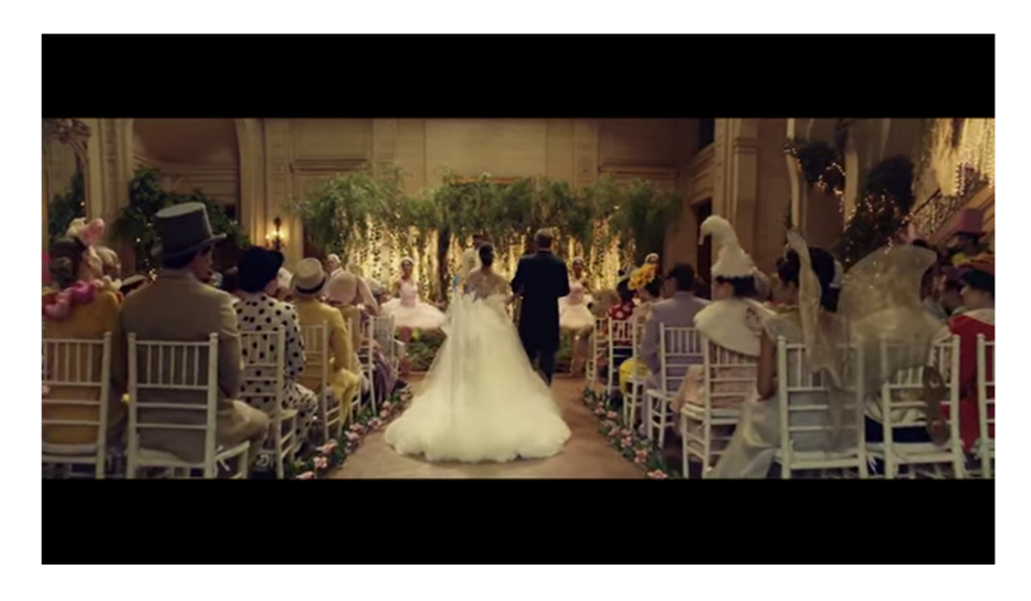
Figure 19. 2010s Fairy Tale Mashup PNC Bank Commercial.

The ad depicts a wedding attended by unicorns, teddy bears, ballerinas, soldiers, hummingbirds, and magically blooming flowers. The father, who walks his beautiful princess down the aisle, watches as his daughter marries prince charming. In the end it turns out the commercial takes place in the mind of a father watching his young daughter while she reads a book of fairy tales. Commercials like these are