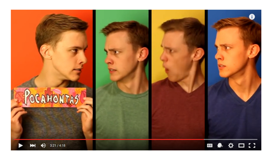
Figure 5. Reaction to Pocahontas' violent solution to colonialism. [15]

greeted us with guns and germs and steel<sup>9</sup>/They forced us into unknown lands of exile/They pillaged, raped, and left us all for dead/So now I'm far more liberal with a weapon/When I separate their bodies from their heads/Have you ever held the entrails of an English guy? Or bit the beating hearts of Spanish men?/Can you shoot an arrow in some French guy's eyeball? Can you paint with the red colors in these men?/I can murder if I please cause I'm dying of disease/I can paint with the red colors in these men." (Figure 5)