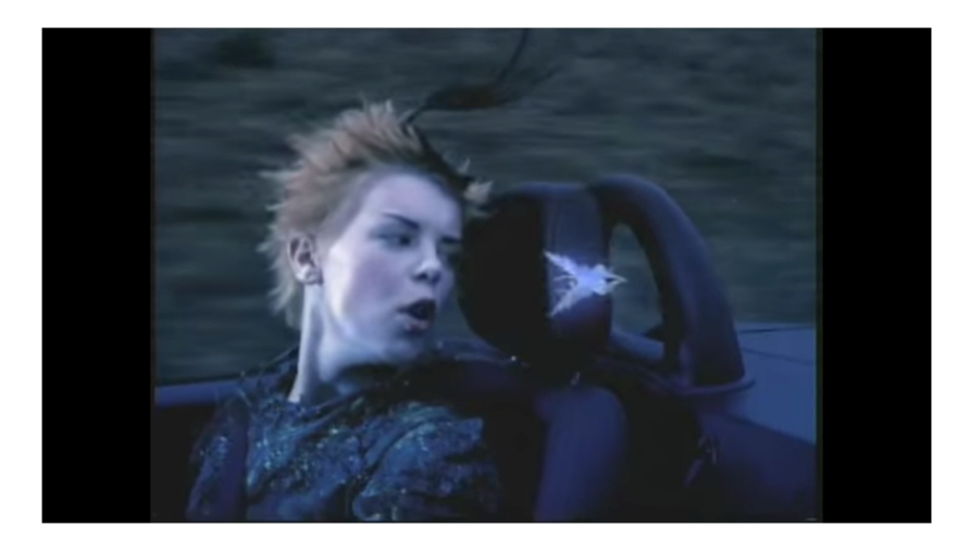
Figure 16. 2000s Peter Pan Mercedes Benz Commercial.

other words, it's never too late to transform your life back to the happiness of youth through spending money. Other clichés from previous decades like sexualizing fairy tale figures continued, as seen in this Pepsi One commercial featuring Kim Cattrall as Goldilocks with the Chicago Bears. On the flip side, commercials like this 7 Up Red Riding Hood spot pushed back on those genre expectations by having Red head-butt the wolf stand-in at the end of the commercial. And other commercials, like this one from Adidas, went for an artistically bold modernization with a stripped-down narrative (See Figure 17).