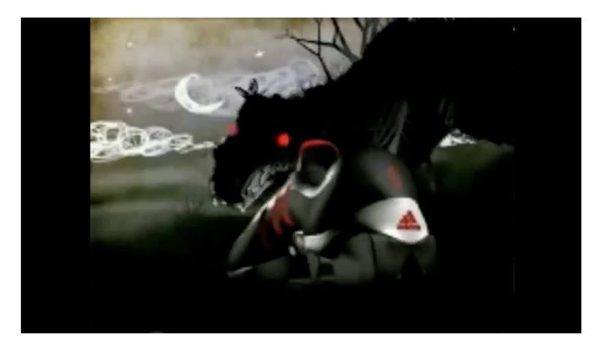
Figure 17. 2000s Little Red Riding Hood Adidas Commercial.