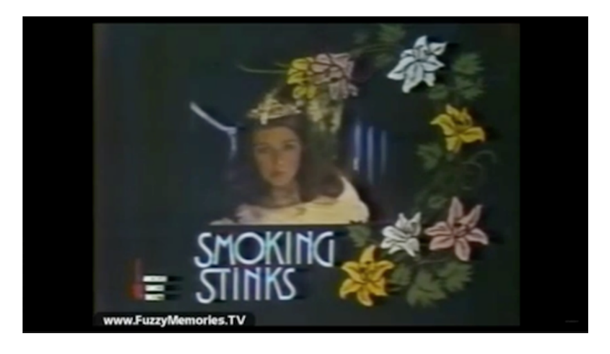
Figure 8. 1970s Rapunzel/Frog Prince/Sleeping Beauty Smoking PSA.

"Give it up, because it stinks" is an effectively simple focus for an important campaign like this, but ultimately what these commercials are really telling their audience is that women need to give up smoking to please men. This campaign