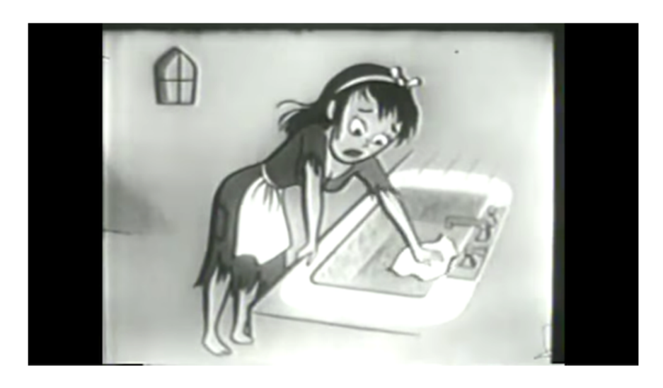
Figure 2. 1950s Cinderella Bab-O Commercial.

This sloppy combination of ads and fairy tales wasn't a localized problem for Bab-O. Submitted for your viewing is a 1952 commercial for Halo Shampoo featuring Goldilocks and the 3 Bears. (See Figure 3)