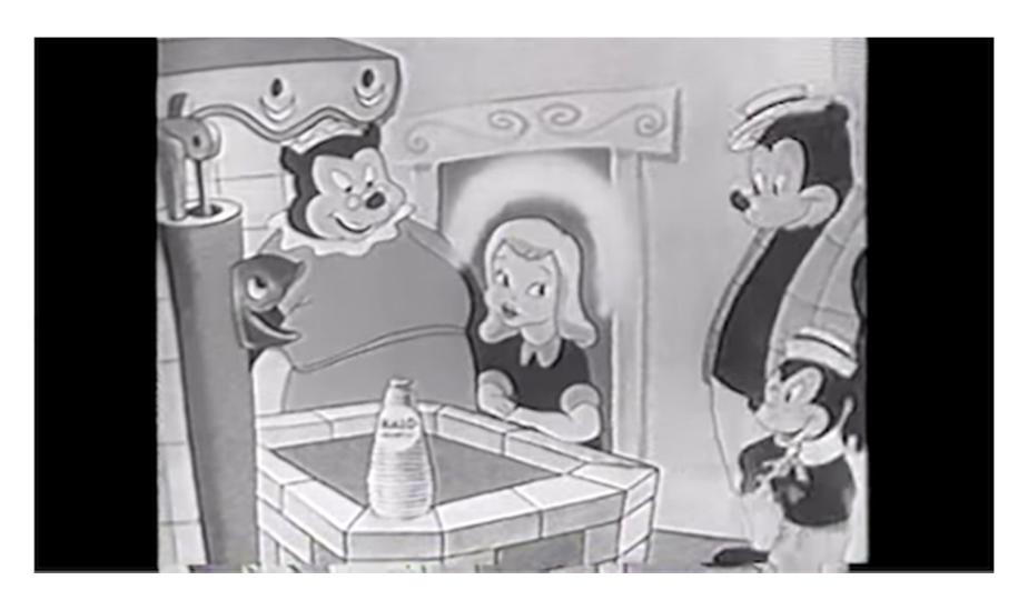
Figure 3. 1950s Goldilocks Halo Shampoo Commercial.

This sloppy combination of ads and fairy tales wasn't a localized problem for Bab-O. Submitted for your viewing is a 1952 commercial for Halo Shampoo featuring Goldilocks and the 3 Bears. (See Figure 3)