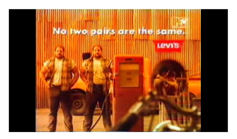
Figure 14. 1990s Cinderella Levi's Commercial.

comes from Levi's. The commercial opens with an image of a clock striking midnight and cuts next to the image of a woman running down stairs, leaving behind a shoe. The iconography is unmistakable and immediately recognizable as a Cinderella story (See Figure 14).