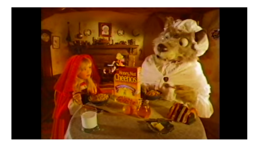
Figure 13. 1990s Little Red Riding Hood Cheerios Commercial.

It is notable that even in this ad featuring lighthearted music, that also presents the wolf as an amusing if not comedic character, it still ends with an ominous reminder that the wolf ate Red's grandmother. The dark nucleus of Red's story survives, even as BuzzBee's rattles off the superlative qualities of Honey Nut Cheerios. One of the more interesting fairy tale-adjacent commercials of this decade