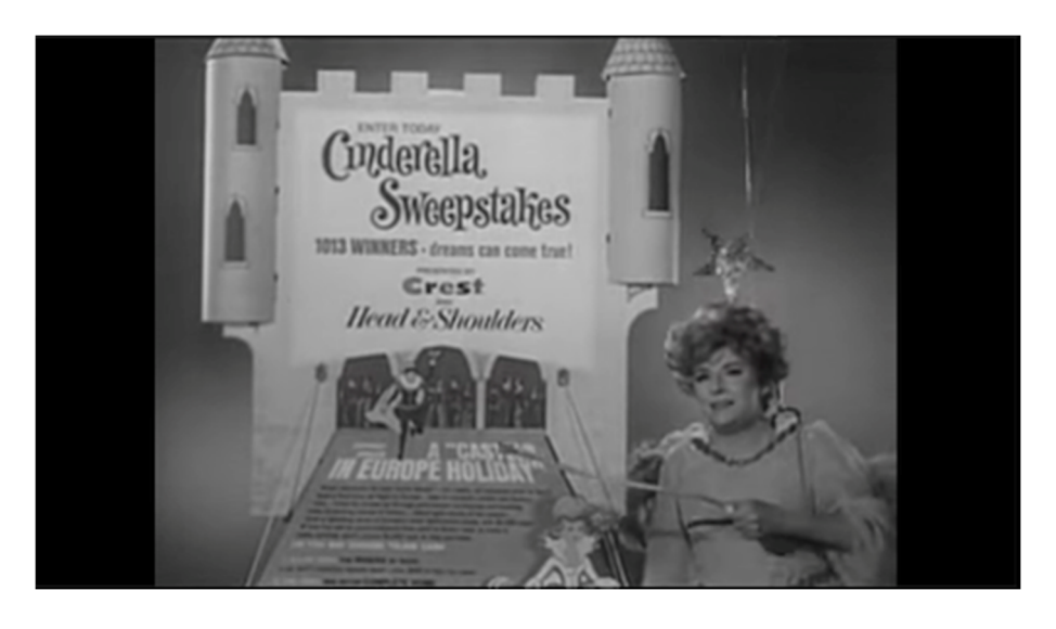
Figure 5. 1960s Crest Cinderella Sweepstakes Commercial.

Next, let's take a look at an advertisement that attempts to blend humor with a fairy tale figure. This time it's the Fairy Godmother, breaking the fourth wall to publicize a prize giveaway from Crest in connection with the 1965 television broadcast of Rodgers and Hammerstein's Cinderella (See Figure 5).