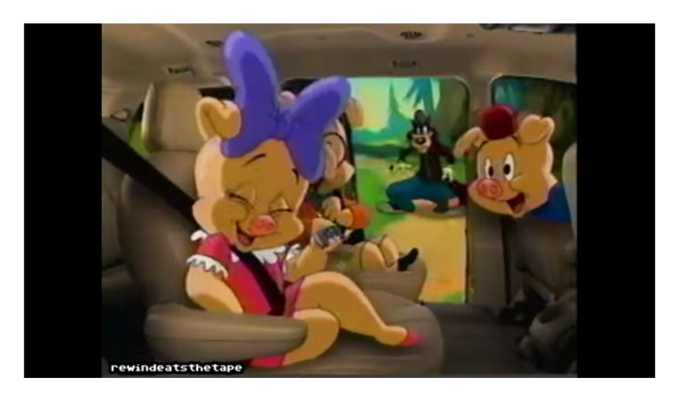
Figure 12. 1990s Three Little Pigs Ford Commercial.

right in the middle of the familiar story without explanation, assuming audience familiarity with the tale. The story is quickly and literally interrupted by a corporate mascot (See Figure 13).