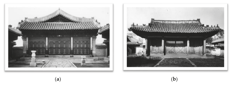
Figure 2. The South Shrine (a) and the East Shrine (b).

of King ( wang \pm 1 ) in the Sinocentric tributary system. Kwanwang Shrines were thus the initial places to house the protecting god of the Ming army. After the withdrawl of the Ming forces from the Korean peninsula, they became centers of the indigenization of the Guandi cult.