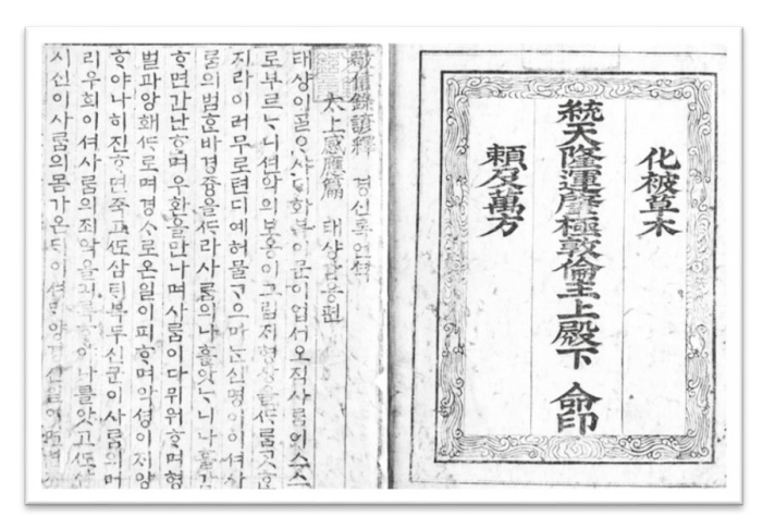
Figure 10. Sprit-Written Inscription in Morality Books (Kyujang-gak Library) Printed by Royal Edict in 1880 (Collection of Kojong's Library).

world]" (hwap'i ch'omok, noegǔp manbang 化被草木, 賴及萬方) was added (SGJ 1880-3-22, 66b). There are plenty of books with these inscriptions in the present libraries of Korea, Japan, France, England, and the United States (HC 1986, v. 2-3; Figure 10). This record not only provides insight into the context of the publication, but also reveals that the celestial duty of Kojong overlapped with that of the Thearch.