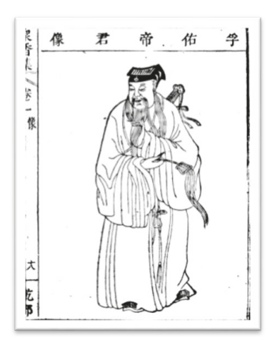
Figure 7. Thearch of Succour [Patriarch Lü] (Collection of Various Fragrance [CHJ] 1881).