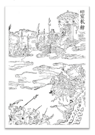
Figure 6. Manifestation of Thearch Kwan in Chosŏn ( Records of Sacred Achievements in the East of Sea [HD] 1876, vol. 1, 1a).

Thearch Kwan himself deconstructed Sinocentrism, in declaring, "I am impartial from the outset, and just protect and bless the good. The Chosŏn state has great fortune on her side. Therefore, her near future will be prosperous" (吾本無私, 惟佑善人. 朝鮮國之運大通, 故年來豊也) (SGJ 1880-10-08, 76a). Spirit-written communication with Thearch Kwan was an important locus of the development of the imagination of Chosŏn's place in a post-Ming order and the reformulation of Chinese deities into universal and transcendent standards of goodness.