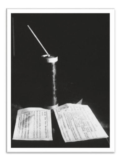
Figure 9. Numinous Lots at the East Shrine (No. 1027-1, National Museum of Korea).

drawing a lot (ch'u-ch'ŏm 抽籤) of fortune-telling poem (Figure 9). There were three kinds of Numinous Lots (lingqian/yŏngch'ŏm 靈籤): Numinous Lots of Thearch Guan (Guandi lingqian 關帝靈籤) in KJ vol. 2, Numinous Lots of the East of the Jiang River (Jiangdong lingqian 江東靈籤) in KS vol. 4, and the Chosŏn original Sacred Lots (Sŏngch'ŏm 聖籤) in KS vol. 3.