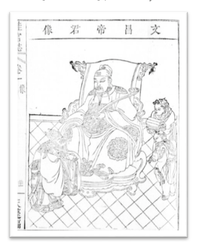
Figure 8. Thearch of Literature [Wenchang] (Record of The Cassia Palace [KGJ] 1881).

A difference in spirit-writing practice in Choson from China was the absence of wood-pen and sandtray. Although the practioners read about the spirit-writing tools and even received a revelation to prepare a sandtray (SGJ, 41b),<sup>27</sup> they could not make them. Eventually, Thearch Kwan instructed them to replace the sandtray with red square papers, and a wood-pen with a brush-pen, the pen-holder for which was made of copper and carved with a phoenix (SGI, 75a-b).<sup>28</sup> It was apparent that in the late Chosŏn period, spirit-writing was performed with the medium of writing down directly on a paper with an inked brush-pen.<sup>29</sup> Not only that, the revelations were varied in type: they wrote down the spirit-medium's dream (hyŏngmong 現夢) and words that he heard from deities; they used