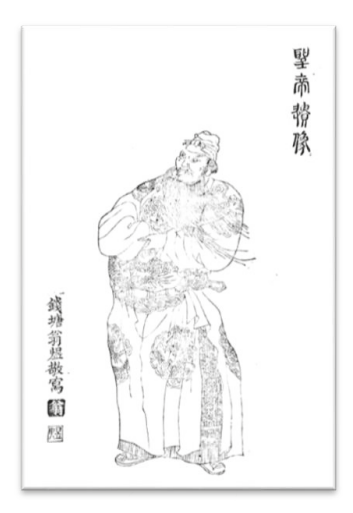
Figure 5. Thearch Kwan (Complete Collection of Illustrated Records of Sacred Achievements of the Thearch Lord Sage Kwan [KJ] 1876, vol. 1, 1b).