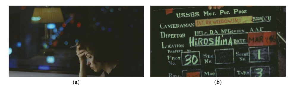
Figure 4. Frames from H Story . A shot of Béatrice Dalle drinking alone ( a ) is followed by a sequence of archive images from the Hiroshima bombings ( b ).

Archive images reappear in H Story for a second time towards the end of the film, when the decision to close down the shoot has been taken. In this instance, the images do explicitly reference the bombing of Hiroshima: they comprise a panoramic view of the ruins of the recently bombed city (Figure 5a). The scene is followed by a shot of Dalle and Machida walking along various streets in the city (Figure 5b), where it is clear that their walk is separate from the remake and the mocked-up 'making of'. What has happened before this sequence of shots? Through his complex mise en abyme, Suwa has called into question the very possibility of drafting a fiction around Hiroshima. Neither Hiroshima mon amour nor his projected remake can be anything more than a fixed part (literally, a still image) of the "discourse of Hiroshima", which amounts to a further barrier between the actual events (the bombing of the city) and the present.