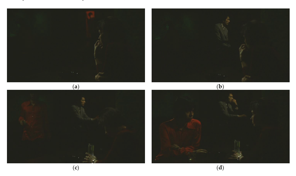
Figure 3. Four frames from H Story taken of a unique static shot showing the entrance of actors Hiroaki Umano (a,b) and Kou Machida (c,d) changing the dynamic of attractions around the main character played by Béatrice Dalle (at the right of the images).