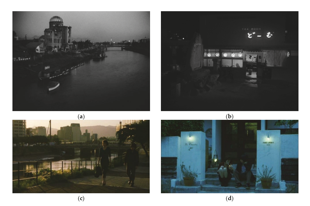
Figure 2. Frames showing similar sets in Hiroshima mon amour and H Story : the Ota River ( a , c ) and the restaurants ( b , d ) where a key scene takes place in both films.