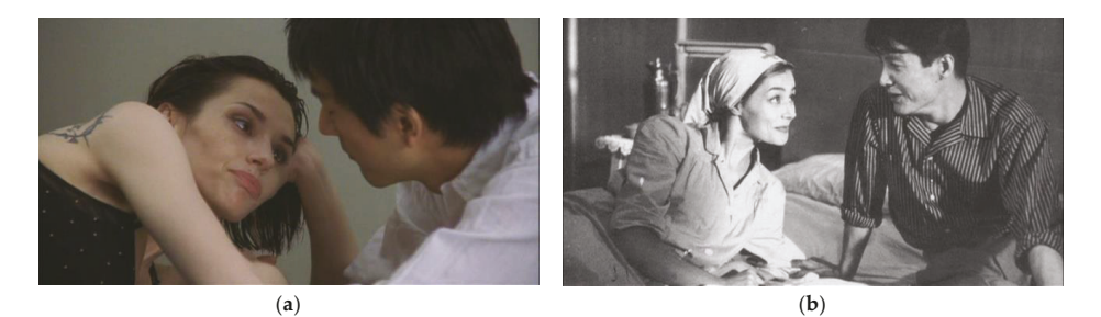
Figure 1. Frame ( a ) from H Story showing actors Béatrice Dalle and Hiroaki Umano representing a scene of Hiroshima mon amour , followed by a frame of the film ( b ) showing a photography of the original scene played by Emmanuelle Riva and Eiji Okada.

same time, however, the film within a film is split between the script written by Duras, which is quoted word for word, and the shots of Dalle and Umano which allude indirectly to the scenes shot by Resnais. There is only one explicit visual quotation after the film's opening sequence, in which Dalle and Umano re-play the first scene in Hiroshima mon amour . The final frame is a medium shot of the lovers in bed (Figure 1a), an image that fades to black, followed by a shout of "Cut" and the sound of the director giving his orders. The black screen brightens to a still image from Hiroshima mon amour in which Riva and Okada are seen in a similar pose to the figures in the previous frame (Figure 1b).