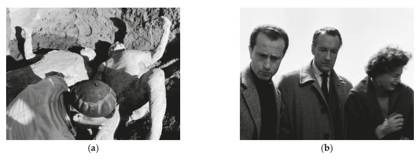
Figure 8. Frames from Journey to Italy . A revealed plaster statue representing a man and a woman who died in Pompeii ( a ), followed by a counter shot of the three characters looking at it ( b ).

A similar story is told about Catherine and revealed in her wanderings (the number of pregnant women she sees on the streets of Naples, for instance). In both Journey to Italy and A Perfect Couple , these sub-plots concerning hidden desire lead to a second encounter with sculptures on each main character's part. In Journey to Italy , the second experience takes place at the site of the excavations in Pompeii rather than the National Archeological Museum in Naples. Catherine witnesses the discovery of the traces of two bodies from the Roman period which had been buried under the lava of Vesuvius. This sculpture is made in the real time of its discovery. The archeologists make a set of holes in the fossilized lava, into the space shaped by the bodies of the dead before they decomposed, which they then fill with plaster. The dried plaster takes the form and position of the bodies at the time of their death. When the archeologists dig out the plaster-sculpture, they discover it represents a couple: "Probably husband and wife. They died together," says one of the archeologists. Rosellini shows the recently revealed plaster statue (Figure 8a), followed by a counter shot—a framed medium shot—of Catherine, her husband and the archaeologist looking at it (Figure 8b). She abruptly exits the scene, weeping at the sight of the sculpture. Rosellini included her reaction, within the same scene, counterpointed by the calm with which the two men contemplate the discovery.