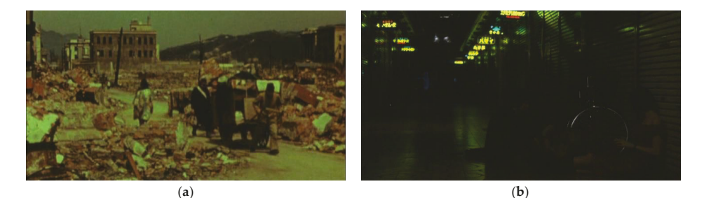
Figure 5. Frames from H Story . A panoramic view of the ruins of the recently bombed Hiroshima ( a ) followed by a shot of Dalle and Machida walking along the city in present ( b ).

Archive images reappear in H Story for a second time towards the end of the film, when the decision to close down the shoot has been taken. In this instance, the images do explicitly reference the bombing of Hiroshima: they comprise a panoramic view of the ruins of the recently bombed city (Figure 5a). The scene is followed by a shot of Dalle and Machida walking along various streets in the city (Figure 5b), where it is clear that their walk is separate from the remake and the mocked-up 'making of'. What has happened before this sequence of shots? Through his complex mise en abyme, Suwa has called into question the very possibility of drafting a fiction around Hiroshima. Neither Hiroshima mon amour nor his projected remake can be anything more than a fixed part (literally, a still image) of the "discourse of Hiroshima", which amounts to a further barrier between the actual events (the bombing of the city) and the present.