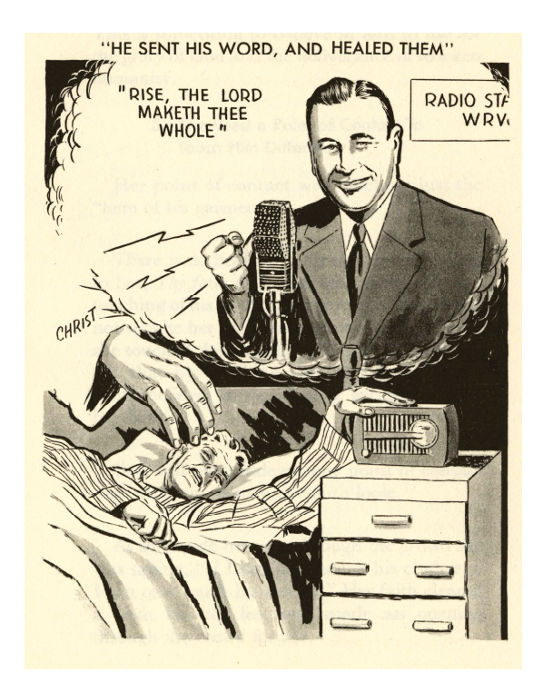
Figure 2. Cartoon illustration from If You Need Healing Do These Things.

The mouth of the speaker allowed the hand to hear, And the patient touched the radio to bring the healer near.