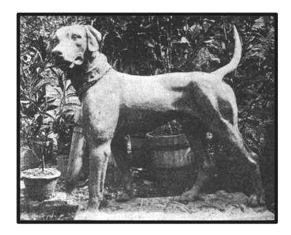
Figure 2. Ingalls' Dog Statue [25].

I continued "It cannot do anything for you or any other person," and then I told them that I had brought it here to show up their false customs of making an idol, calling it a god and trusting in it for help. They said their god was consecrated, but I told them it was not changed in power after it came from the maker's hand, and that my old dog passed through a fire-consecration when he was made, but he had no life or power [25].