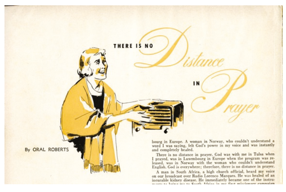
Figure 3. Illustration from the Healing Waters Magazine.