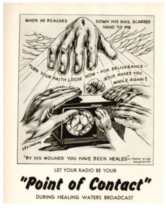
Figure 1. Illustration from Healing Waters Magazine.

[27:02] song "Only Believe" Only believe, only believe, All things are possible, only believe. Only believe, only believe, All things are possible, only believe.