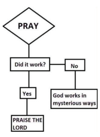
Figure 2. © unknown.

Furthermore, jokes that portray religion as misogynistic are common. Especially popular are cartoons of women wearing the burqa. In Figure 3, one woman is commenting on another woman who "dares" to show her ankles. Moreover, beauty contests where everyone looks the same, and bus seats or bin bags that are "accidentally" taken for women with burqas are frequently made jokes. This is often contrasted with men wearing fewer clothes: a woman, wearing a burqa, is sweating on the beach, while her husband next to her only wears swimming trunks. Another target are Muslim feminists, in jokesthat portray feminism and Islam as incompatible. Besides that, in many memes, Islam and other