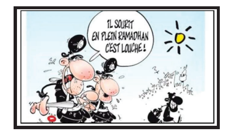
Figure 9. © Dieu, journal Liberté Algérie.

Of course, many members of Facebook groups also make jokes that are not (directly) related to religion, such as memes about former US President Donald Trump. However, a specific kind of humor can be distinguished that criticizes laws based on religious norms, mocks religion, as well as its followers, leaders, and figures, and reflects on clichés and stereotypes about non-believers. This leads to the question: what is the purpose behind these different kinds of jokes? Can we see them as forms of activism or do they have a mere entertaining purpose?