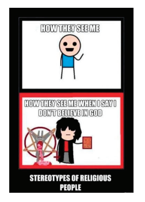
Figure 6.

Other jokes focus on the personal restrictions that non-believers encounter. Figure 7 shows a mother holding the mouth of the "dog" (her child) to not say anything negative or critical about religion in the presence of the rest of the family. In this and other cartoons, social mechanisms such as hchouma , which can be roughly translated as "bringing shame" to oneself or the family, become evident. Furthermore, how to behave correctly during Ramadan has been a topic in jokes for a long time. This can be exemplified by comparing the following two cartoons (Figures 8 and 9), which have been published with around twenty years of discrepancy.<sup>18</sup> The first cartoon poses the question: "You eat during the middle of the day?", upon which the old man answers: "It's chewing gum". The second cartoon portrays two police officers who comment on a man walking down the street: "He's smiling during Ramadan- that's suspicious".