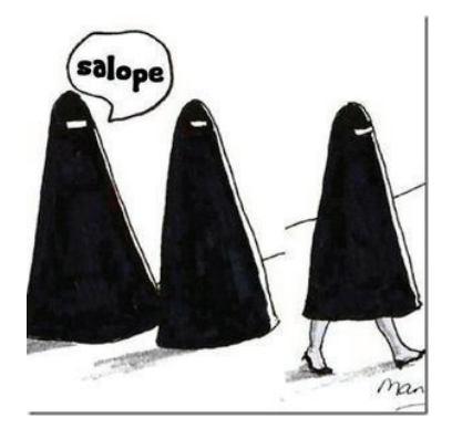
Figure 3. © man.

religions are often described as violent, which is contrasted with the self-display of being religions of peace. For example, aliens look down on the planet Earth and comment, "they are fighting over which religion is the most peaceful". This leads to a picture of religion in general and Islam in particular as being irrational, misogynist, and violent. Yet, these humorous presentations are not uncontested among non-believers.