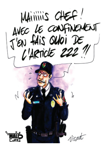
Figure 1. © MALI/Visant.