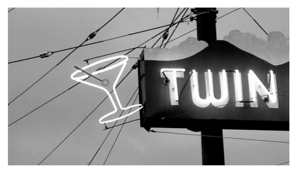
Figure 5. Tina Takemoto, Semiotics of Sab , digital video, 5:35 minutes, 2016.

War II. As the film introduces this new organizational pattern of images, a voice over from Shimono's 1993 film Suture begins: "How is it that we know who we are? We might wake up in the night and wonder where we are. We may have forgotten where the window or the door or the bathroom is ... But we never wonder who we are." (Shimono 1993)