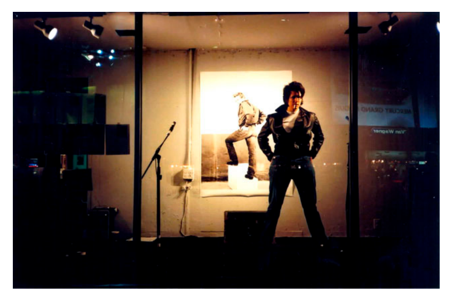
Figure 7. A.L. Steiner, Swift Path To Glory , 2003–2007, digital video, TRT 9:44, 2003/2007.

so much cultural debris littering the congested urban street where it was filmed—its camp value, its queerness, arising and falling in the eye of the beholder.