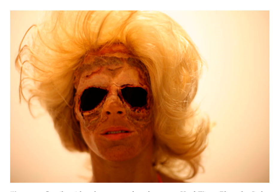
Figure 8. Cassils, video document of performance Hard Times , Photo by Luke Gilford, 2013. Used with permission.

of professional bodybuilding where intense training and discipline are required to shape the body into a flawless reflection of the Greek ideal of human form. Cassils's performance is a six-minute series of poses that are meant to glorify the body's perfection. The performance takes place on scaffolding, surrounded by theatrical lights and the regalia of high drama. Wearing a gruesome prosthetic mask (Figure 8) meant to represent the Greek profit Tiresias (Fisher 2018), Cassils gazes out at us from behind the mask's blinded eyes as spectacle and oracle.