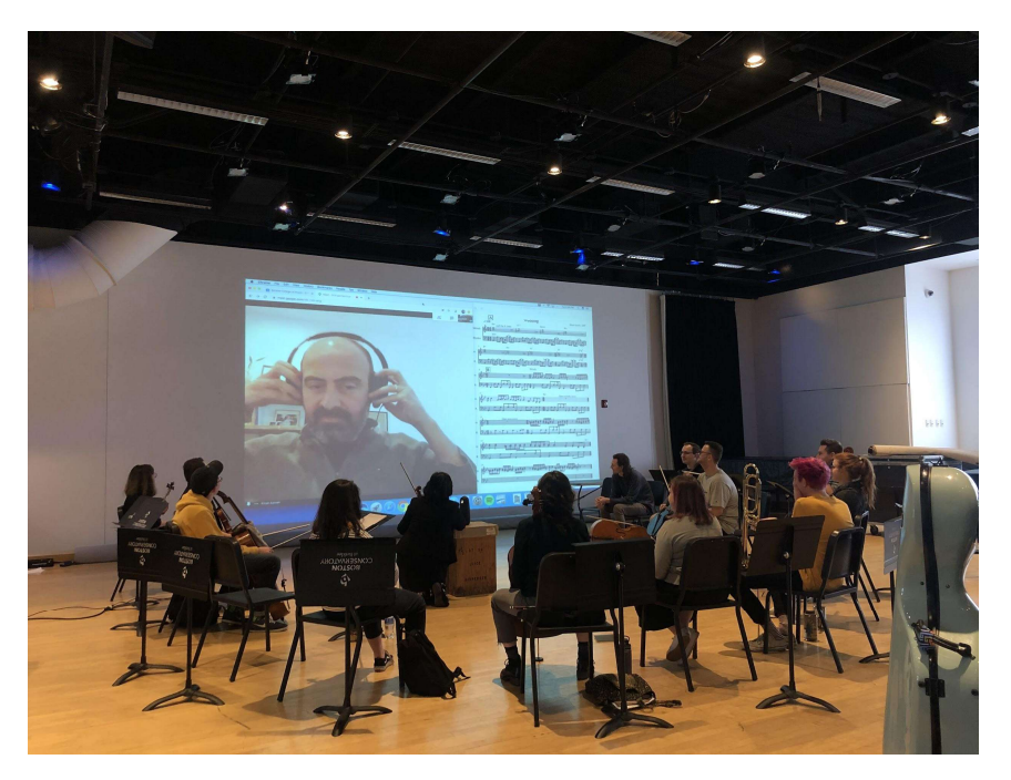
Figure 1. Last face-to-face session of Boston Conservatory's Silk Road Creativity Lab in 2020 with Syrian clarinettist Kinan Azmeh zoomed in from New York City.

Kurdish kamancheh player, representing classical music of Iran; Sandeep Das, an Indian tabla player and 2017 Guggenheim fellow who frequently expands upon conventions within Indian classical music; Judd Greenstein, American composer of music that often features variable instrumentation and influences, as well as the founder of the ensemble The Yehudim; Gabriela Lena Frank, composer-in-residence at the Philadelphia Symphony Orchestra, and the winner of a Latin Grammy; Mazz Swift, an American self-proclaimed "Violin/Vox/Freestyle Composition Artist", and Kinan Azmeh, a Syrian clarinettist, improviser, and composer.