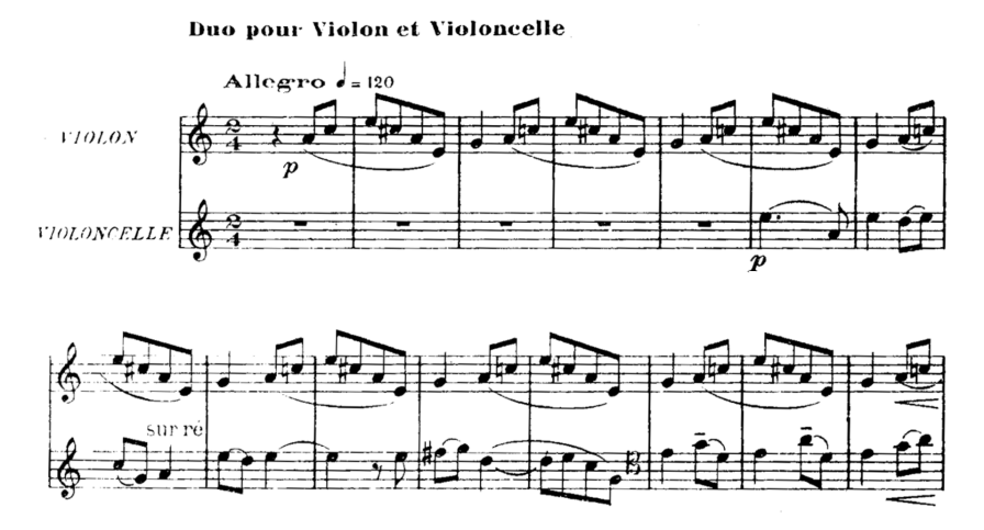
Example 2. Ravel Duo pour Violon et Violoncelle (Ravel 1920) bb. 1–15, La Revue musicale .

The implication is clear: the traditional registral placement of the two instruments should not be read as indicating their musical relationship or hierarchy—or role. The opening of the violin part, which contains the more unusual presentation, is shown in Example 3. We begin to see here what Jankélévitch is pointing towards by noting the absence of the "support" of an accompaniment, and the "mercurial mobility" of the parts.