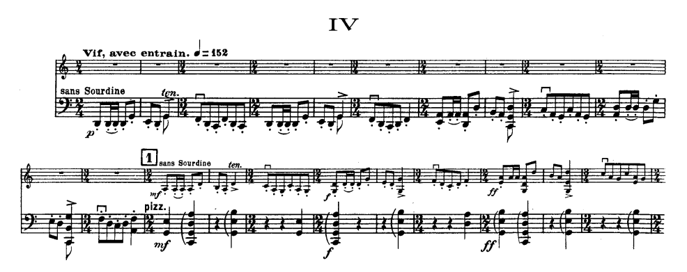
Example 16. Ravel Sonate pour Violon et Violoncelle (Ravel 1922a) iv, bb. 1–21 (cello part), Éditions Durand.

Where, then, does Ravel's "mechanical rabbit" (Jourdan-Morhange 1945, p. 186) fit into the picture? This was the image he offered to cellist Maurice Maréchal for the beginning of the last movement (Example 16) in their work together leading up to the premiere of the Duo. It is an image that we might see as typical Ravelian, combining his love of toys and his fascination with mechanisms of all kinds, but it strikes me as a slightly odd choice for this movement which opens out very quickly to the full-blooded ff iteration in the violin in the seventh bar of Figure 1 (supported by all four open strings of the cello in block pizzicato). In many respects, this movement contains the most traditional chamber music of the whole piece, and the dialogue-like exchanges between the instruments are handled with extraordinary harmonic vividness and a textural density that, in Jourdan-Morhange's words, "often gives the impression of a genuine quartet" (ibid., p. 186).