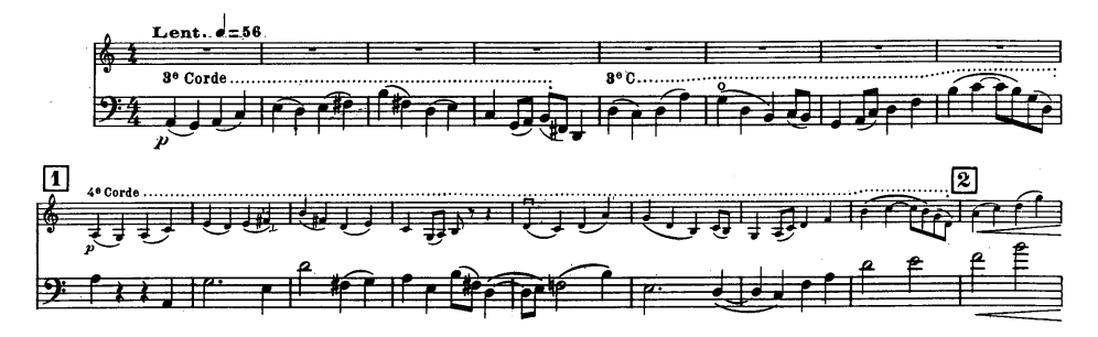
Example 8. Ravel Sonate pour Violon et Violoncelle (Ravel 1922a) iii, bb. 1–17 (cello part), Éditions Durand.

The third movement plays with a number of meeting points or handovers that need to be anticipated in order to avoid obstructing the beautiful long cantilenas, as, for example, in the passing of the melody from the cello to the violin at Figure 1—and, even more beautifully, in the use of the cello to complete the little interlude between the two halves of the violin melody in the fourth bar of Figure 1 (Example 8). At Figure 3, the two instruments are set "against" one another with the harmonic a^1 clash ( a^2 , e^3 in the violin) against the b - flat <sup>1</sup>/ b - flat <sup>2</sup>, which passes from the violin to the cello almost seamlessly (Example 9). Additionally, Figure 10 in the last movement (Example 10) presents another handover that should be, it seems, almost imperceptible (note the dovetailing of the join).