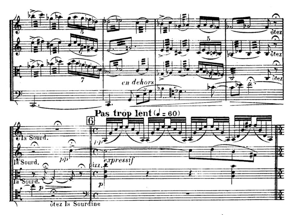
Example 15a. Ravel String Quartet (Ravel 1905a) iii, bb. 60–65, Éditions Durand.

A relatively recent Kreutzer Quartet rehearsal discussion is instructive for drawing out how these kinds of very specialised games need to be "made" to work, and how we might "voluntarily" interact with them. Bars 61–63 of the third movement of Ravel's String Ouartet have a little cello cadenza under the phasing out of the preceding material in the three upper strings (see Example 15a). The c^2 on which the cello ends—not the high point dynamically, which is already interesting—is passed to a natural harmonic c^2 on the viola's C-string and then to the second violin, at the same pitch, who carries this over as the beginning of the new melodic line at Figure 6. Our rehearsal stopped to explore the issues and ask questions: although it is quite obvious that this is, at root, a "simple" passing of the baton from the cello to the second violin, there are a few "obstructions" to it. What is the viola's role? Why are the viola and second violin entries accented?<sup>37</sup> Most importantly, why does the viola have a harmonic? To me, this seemed like a compositional miscalculation. My hunch was that the handover would work much more effectively with the viola stopped at the same pitch, thus effectively providing a "bridge" between the sounds of the cello and violin.