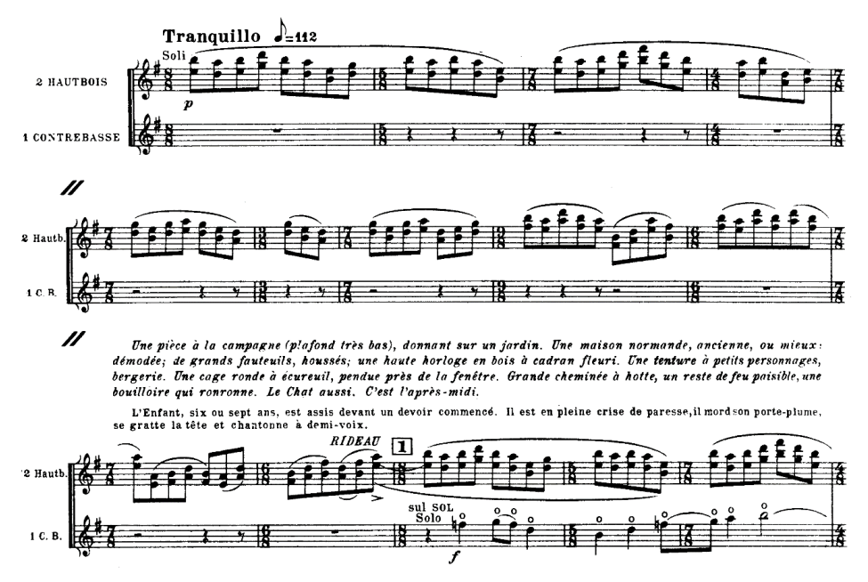
Example 13. Ravel L'enfant et les sortilèges (Ravel 1925) bb. 1–14, Éditions Durand.

Just after the completion of L'enfant, in the Chansons madécasses for soprano, flute, cello, and piano, we find Ravel again exploring the partials from the 10th harmonic downwards on the cello, leading to a handover that absolutely depends on predictive listening (Example 14). I recall very clearly "my discovery", when first playing this piece as a teenager, that the c^1 in bar 9—the second of the stopped pitches in the cello, and implicitly on the G-string—can have almost exactly the same timbre as the flute's bottom c^{1,36} I remember asking the flautist to play this with me in alternation several times, just so that we could "feel" the potential. In this single-note handover, the initial bitonal dialogue between the two instruments is brought "around" in a kind of Möbius strip: the holding over of the cello to overlap with the flute in bar 10 is clearly designed to assist in blending the colours, but it requires quite a bit of "help" from the players. While writing this chapter, I listened to a number of recordings and was very disappointed to find that this particular "ball" seems very often to have been dropped, or possibly simply to have gone unnoticed—or that a sound edit has been made that breaks continuity. Without an extra bow sneaked in under the singer's entry, there is not enough "air" in the cello sound to make the illusion work,