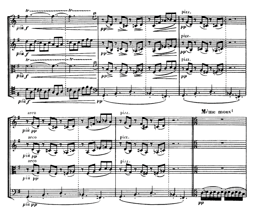
Example 1. Debussy String Quartet (Debussy 1894) ii, bb. 163–168, Éditions Durand.

model for Ravel's Quartet (Ravel 1905b).<sup>11</sup> Perhaps more significantly, when the Duo was published in full in 1922, as the Sonate pour violon et violoncelle (and dedicated to the memory of Debussy), the choice of "Sonata" as a title seems to point specifically to Debussy's late music and his unfinished set of six sonatas for some rather recondite combinations: Debussy's violin sonata was originally to have included a cor anglais, and he had projected sonatas for "oboe, horn and harpsichord", and "trumpet, clarinet, bassoon and piano", as well as a large "Concert".<sup>12</sup>