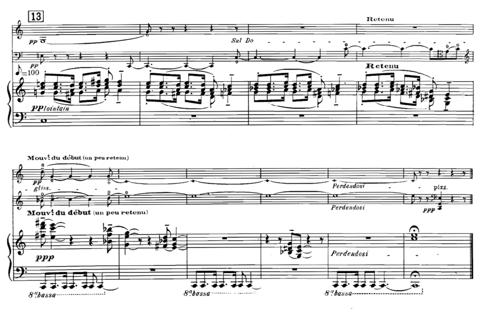
Example 12. Ravel Piano Trio (Ravel 1914) i, bb. 108-117, Éditions Durand.