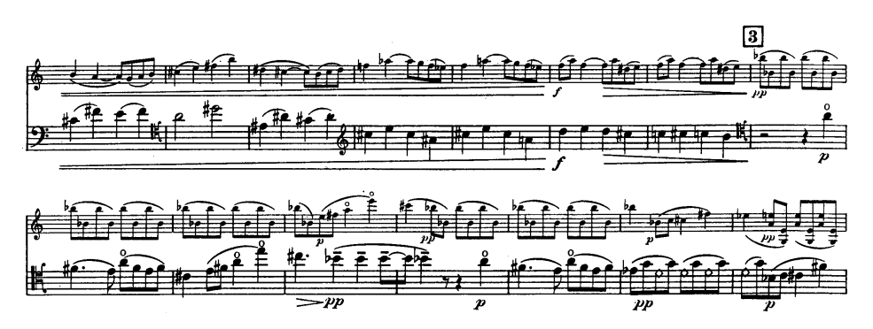
Example 9. Ravel Sonate pour Violon et Violoncelle (Ravel 1922a) iii, bb. 18–32 (cello part), Éditions Durand.