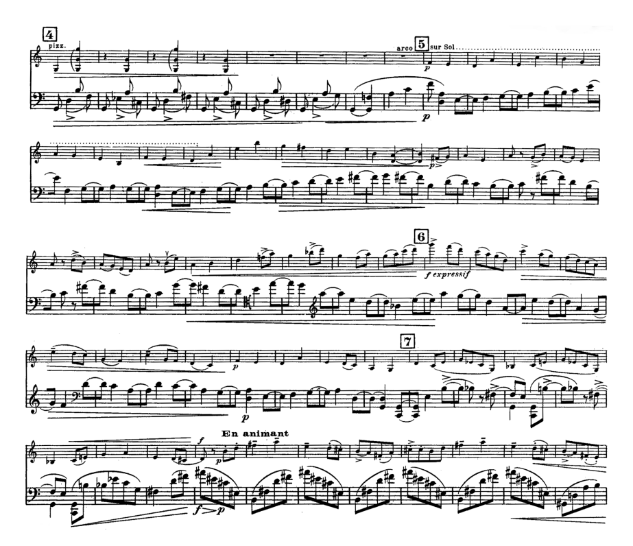
Example 7. Ravel Sonate pour Violon et Violoncelle (Ravel 1922a) i, bb. 61–119 (cello part), Éditions Durand.

There is a kind of "quasi-hocketing" that recurs through the sonata in different forms that recalls, for me, my dog "running with the ball" (i.e., not catching or holding it, but matching pace with it, again recalling Caillois's illinx ). In these games, the relationship between figure and ground is often in play, as we can see at Figure 5 of movement i (Example 7). It may seem obvious that the violin "leads" here, as it is initially given a single-string melody on the beat; however, playful voicing of the cello, which has the "bass" (naturally heard as a foundation), and real care to make the rhythmic relationship between the two instruments completely even can usefully create a feeling of suspension between the two instruments, and it is only after Figure 7 that this "running with" the material resolves into a stable relationship.