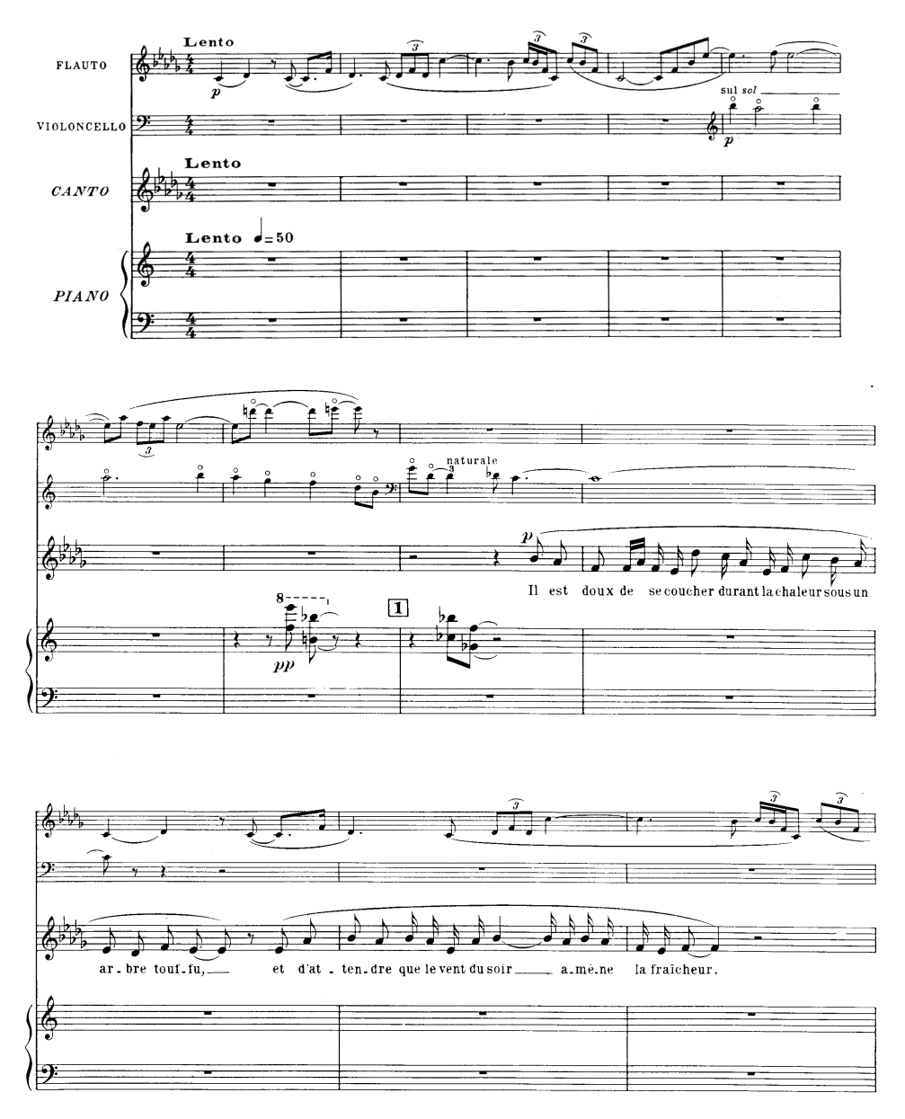
Example 14. Ravel Chansons madécasses (Ravel 1926) iii, "Il est doux ... ", bb. 1–12, Éditions Durand.

and the flute needs to re-enter a little carefully to avoid the new entry feeling like a cinematic "cut" rather than a dissolve, or transition. Perhaps even more than the Duo example, this reveals how necessary it is that everyone "understands" the game if it is to play out.