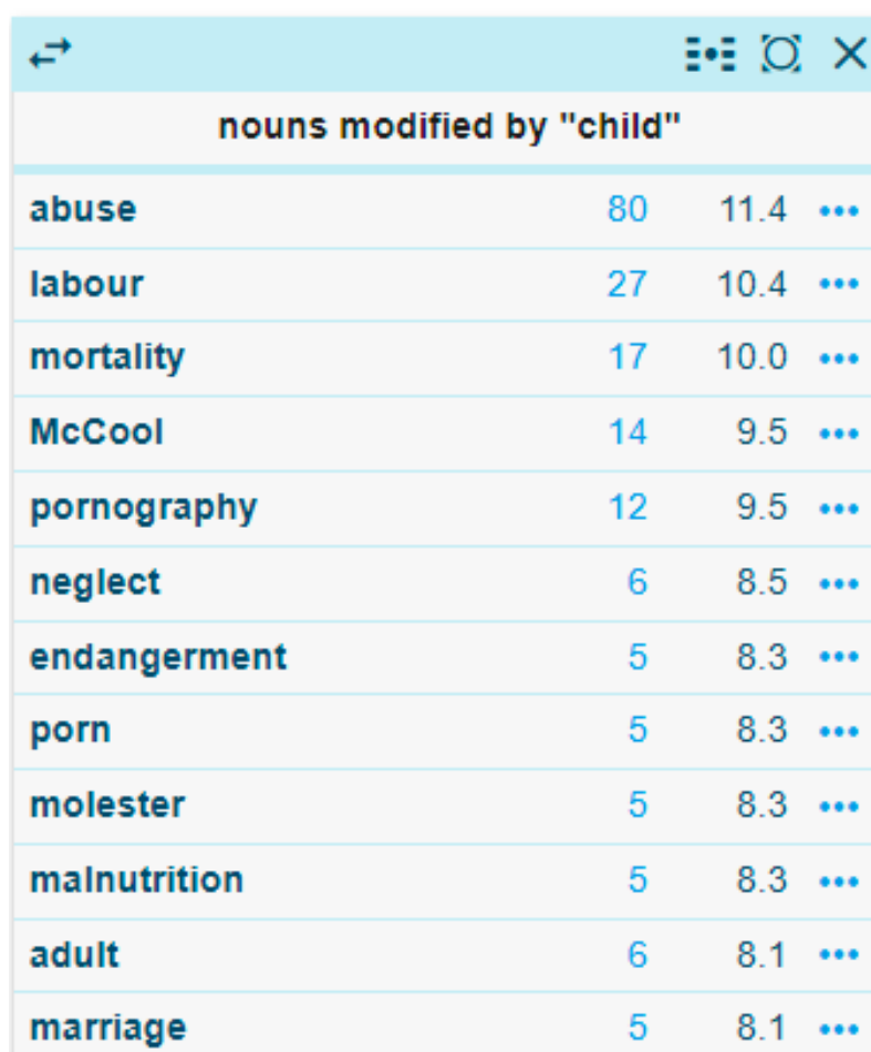
Figure 2. Nouns modified by child (Sketch Engine).

second, only, own ). Three adjectives describe children as being in a potentially dangerous or abusive situation or susceptible to suffering from harm ( missing, vulnerable, and innocent ).