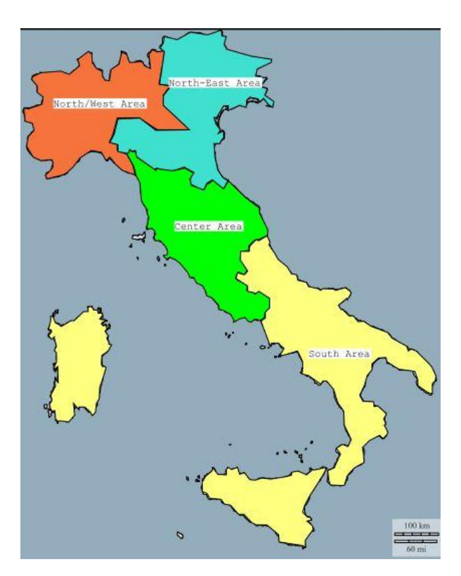
Figure 1. Geographical Macroarea.

Abruzzo is classified as Southern Italy for historical reasons, as it was part of the Kingdom of the Two Sicilies before the unification of Italy in 1861 (Figure 1):