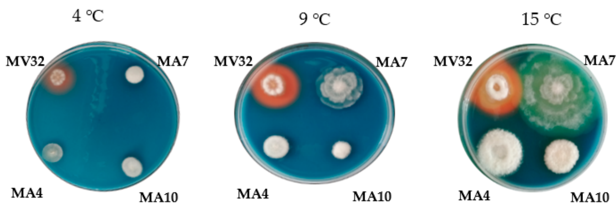
Figure 2. Production of siderophores by Mortierella strains on the Chrome azurol S agar medium at three temperatures of incubation, 4, 9, and 15 °C (data not published). Arrangement of the strains on the plate: clockwise from top left— M. verticillata DEM32 (MV32); M. antarctica DEM7 (MA7); bottom from left— M. antarctica DEM4 (MA4); M. antarctica DEM10 (MA10) (the psychrotrophic strains isolated from the Spitzbergen soils).

Until now, there is limited data concerning siderophore production by Mortierella species, especially these isolated from the area of harsh climatic conditions. Among four tested Mortierella strains isolated from Spitzbergen soils only M. verticillata DEM32 was capable of releasing these low-molecular mass compounds with a high affinity to Fe and change the color of solid medium after incubation at three different temperatures (Figure 2) (data not published). Moreover, except for some plant growth-promoting activities detected at lower temperatures [8], this fungus also revealed the production of siderophores at conditions found in the temperate climate soils making it an attractive inoculant for the agricultural soils.