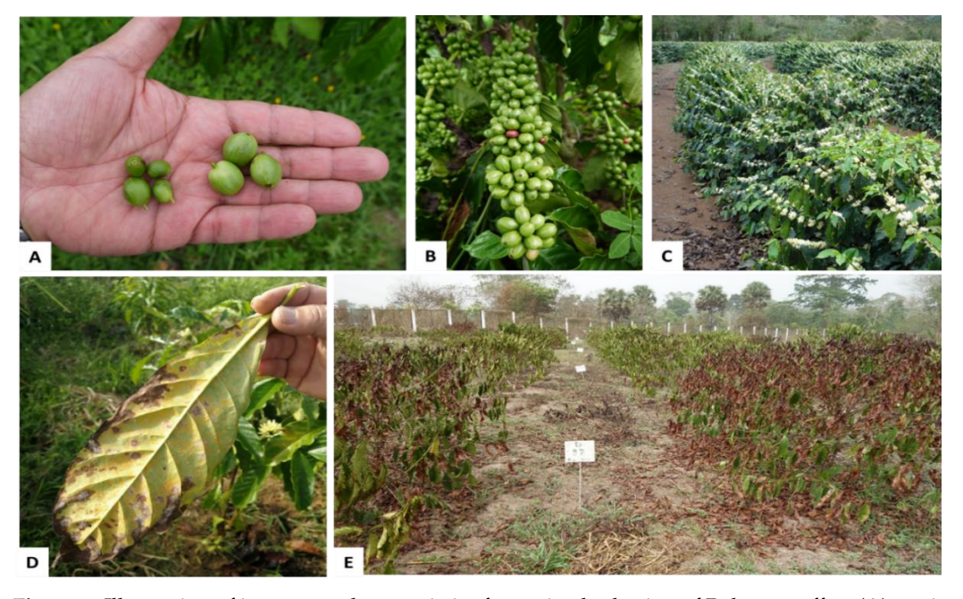
Figure 1. Illustration of important characteristics for varietal selection of Robusta coffee. ( A ), grain size; ( B ), productivity; ( C ), uniformity of flowering; ( D ), lack of rust or other diseases; ( E ), drought tolerance.

Thus, clonal varieties are possible in Robusta coffees. Another strategy is to increase the existing variability through crossing between the best individuals from the same population or from different populations. In this case, the selection is carried out after examining the progeny derived from said crosses, for which the so-called recurrent selection is used. Its objective is to increase the frequency of genes carrying traits of interest within the population, through successive cycles of recombination and selection. Robusta coffee breeding goals are shown in Figure 1.