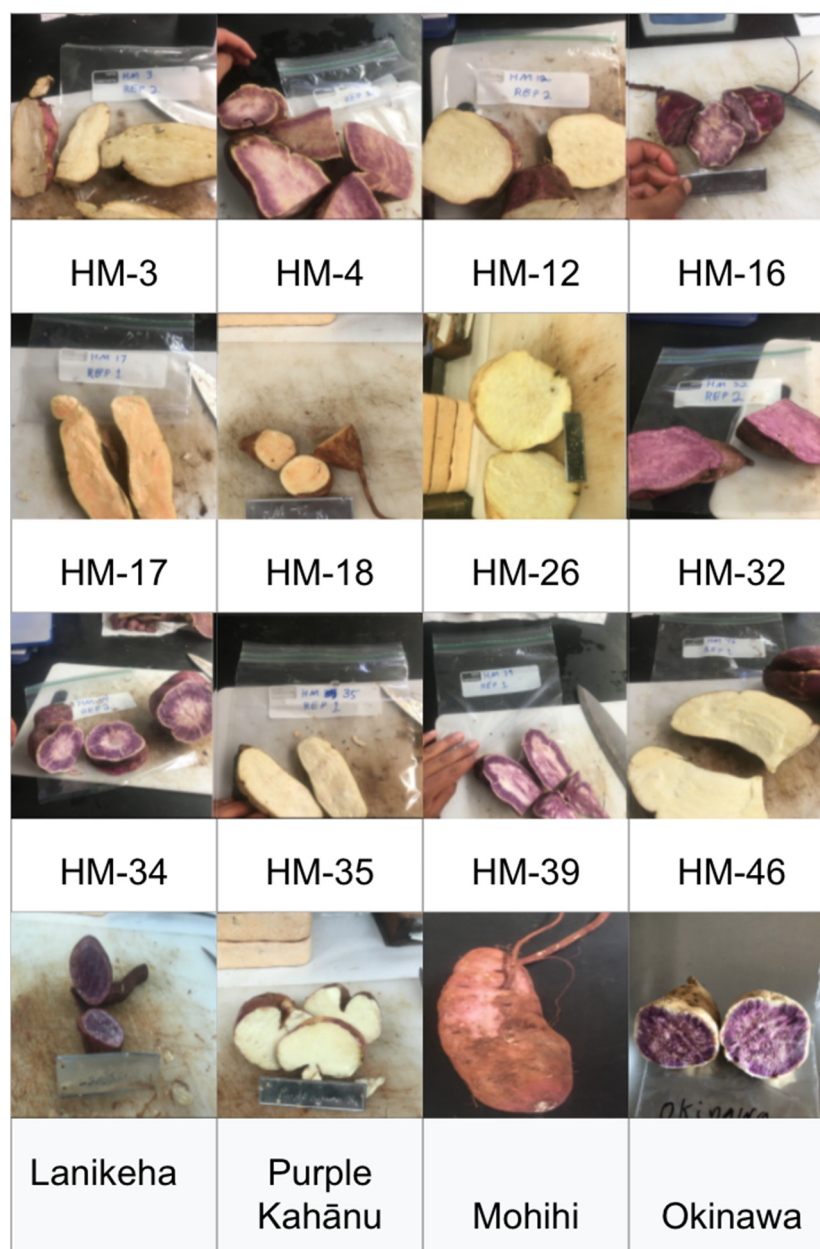
Figure 1. ‘Hawaiian Heritage’ breeding lines and check cultivars evaluated during this experiment. Okinawan is the commercial standard in Hawai‘i, while Mohihi from Lyon arboretum is the maternal parent, Purple Kahānu and Lanikeha are traditional Hawaiian varieties.

evaluations, 12 superior F 1 lines were selected (Figure 1), and four check cultivars were sourced: (i) ‘Okinawan’, the standard commercial cultivar grown in the state, (ii) ‘Lanikeha’, a traditional Hawaiian variety prevalent among homesteaders on Molokai, (iii) ‘Kahānu Purple’, a popular variety used for traditional agricultural systems research on the Big Island, and (iv) ‘Mohihi’, the maternal parent sourced from Lyon Arboretum.