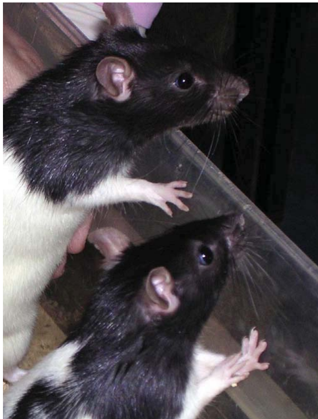
Figure 5. Two outbred laboratory rats, of the Lister Hooded (Long–Evans) strain. Rodents are the most commonly used laboratory animals, making up nearly 80% of the total of animals used in the European Union, followed by cold-blooded animals (fish, amphibian and reptiles, making up a total of 9.6%) and birds (6.3%) [159]

2007 Nobel Prize. In 2002, the mouse became the second mammal, after humans, to have its whole genome sequenced. These, along with other technologies, have opened unlimited possibilities for the understanding of gene function and their influence in several genetic and non-genetic diseases, and have made the mouse the most commonly used animal model in our day (for a historical overview of the use of the mouse model in research, see [157,158]), with prospects being that it will continue to have a central role in biomedicine in the foreseeable future.