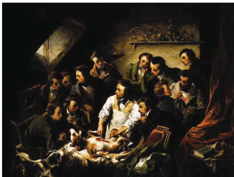
Figure 3. “A physiological demonstration with vivisection of a dog,” by Émile-Édouard Mouchy. This 1832 oil painting—the only secular painting known of the artist—illustrates how French scholars valued physiological experimentation in service of scientific progress [90]. Notice how the struggling of the animal does not seem to affect the physiologist or his observers. Currently part of the Wellcome Gallery collection, London.