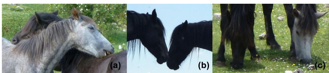
Figure 1. Pairwise involvement in (a) mutual grooming, (b) friendly approach, and (c) spatial proximity.

Affiliative approaches (Figure 1b) were counted when a horse approached and stayed within one body length of another horse, when an approach elicited a reciprocal affiliative reaction (the approached animal moving towards the approacher) or a neutral reaction of the approached horse (the approached animal did not move). Approaches that resulted in grooming were not considered, so that the friendly approach and grooming data were mutually exclusive.