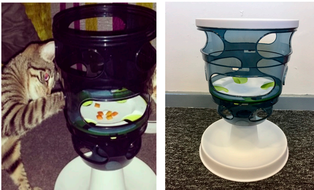
Figure 1. The Catit Senses Food Maze used to assess paw preferences.

Cats' paw preferences for food reaching were assessed using the Catit Senses Food Maze (Catit, UK). This maze is a 35.6 cm-tall spherical feeding 'tower', comprising three levels into which food can be placed. The food is accessed via three holes on each level (see Figure 1). For the purpose of this study, the top level of the food maze was removed as it proved too high for the cats to put their paws into without standing on their rear legs and compromising balance. The Catit has been used successfully to record cats' paw preferences [25,26] and demonstrates good test-retest reliability [46].