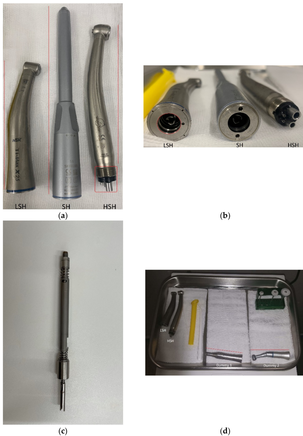
Figure 1. (a) Handpieces used for dental procedures in the study. LSH = Low-speed handpiece; SH = Surgical low-speed handpiece; and HSH = High-speed handpiece. Red lines indicate the external surface sampled of LSH, SH, and HSH. The red rectangle indicates the coupling surface sampled on HSH. (b) Handpieces used for dental procedures in the study. The red circle indicates the coupling of which the first 0.5 cm was sampled in LSH. (c) Shaft of SH; the red line indicates the surface sampled. (d) Some of the dental devices used in the study. The red lines indicate the external surface sampled on dummy 1 and 2.