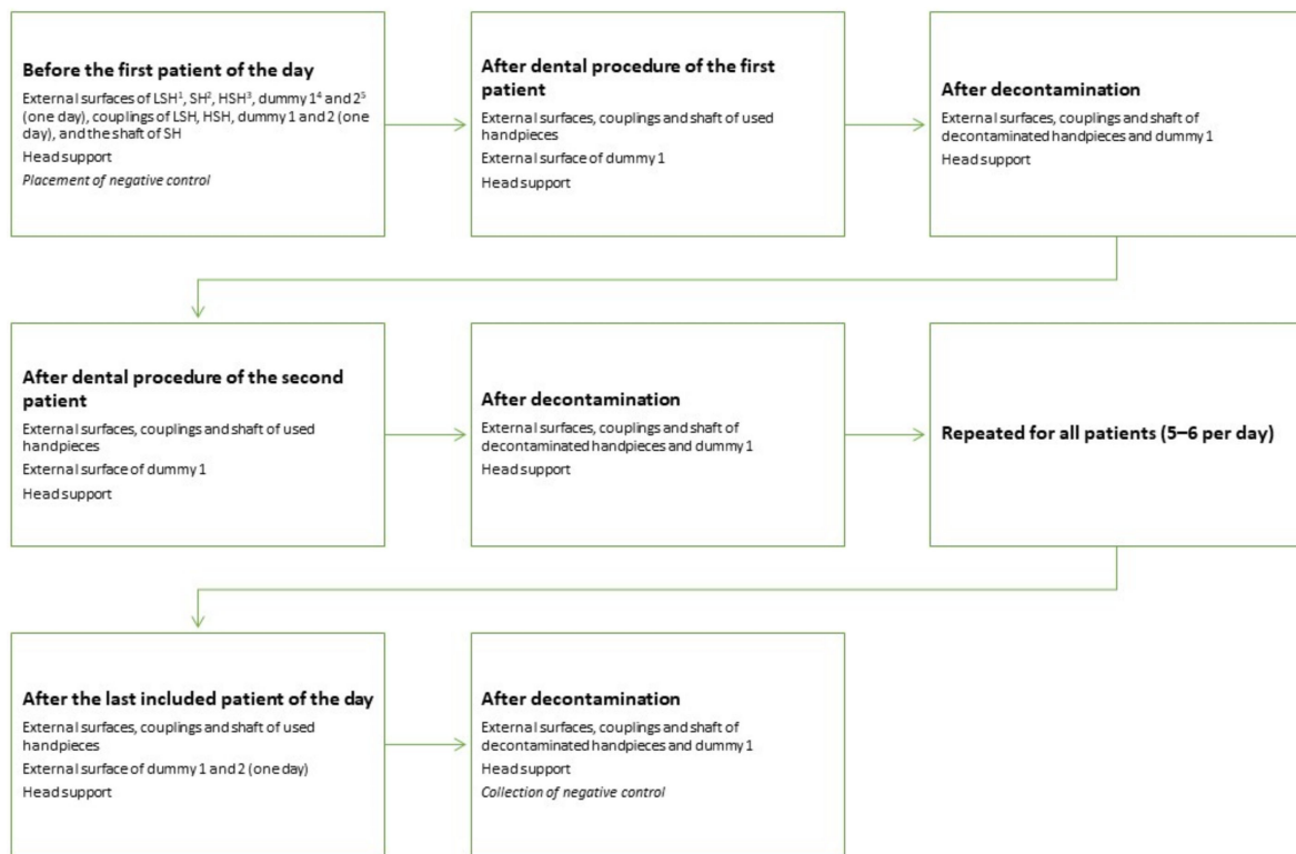
Figure 2. Sampling schedule for the equipment. For assessment of environmental contamination one or two extra LSH (called dummy 1 and 2) and the head support were sampled. The dummies were not used during dental procedure, but consisted of one or two extra handpieces placed close by if needed during the procedure (approximately 70 cm from the patient’s oral cavity). Sampling after dental procedure was carried out within 5 min after the dental procedure was finished and no equipment was rinsed or wiped off before sampling. 1 NSK Ti-Max X25, 2 W&H S-15, 3 Pferdefit-Dental Eco high speed SEA-F4-1-P DEN 1101, 4 NSK FX 65, and 5 NSK NAC-EC.