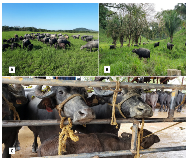
Figure 3. Dual-purpose buffalo production system. (A,B) The Latin American humid tropics offer abundant forage resources, including shrubs and trees, to which buffalo are optimally adapted. (C) Milking with the presence of calves stimulates milk ejection and favors the development of the calves themselves, which is the basis of a dual purpose.