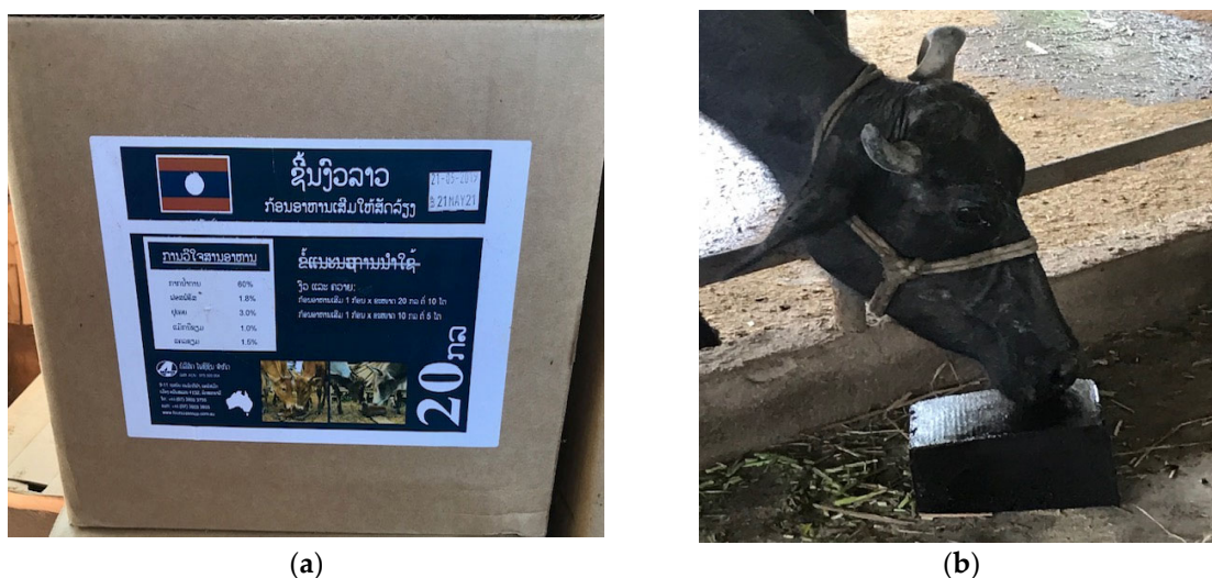
Figure 1. (a) MNB provided to farmers in Lao PDR; (b) buffalo cow consuming UMB10.

As the UMB8 study found the highest ADG was in young calves (<8 m age), this was considered most likely attributable to enhanced lactation yields of their dams. To investigate this, a trial in a recently established commercial Lao Buffalo Dairy (LBD), examined dietary supplementation of lactating buffalo cows with molasses blocks containing 10% urea (UMB10). The trial involved three groups of nine buffalo cows in mid-lactation that were randomly selected, with two groups receiving ad libitum access to UMB10 (Figure 1a,b), with the remaining group free of block supplements [2]. All animals were daily fed fresh Napier grass (30 kg), corn (750 gm), rice bran (1.45 kg), plus accessed fresh Mulatto grass. Daily milk production (DMP) and body condition score were recorded for the 2 months of access to UMB10. Average DMP for the two supplemented groups were 1.02 L and 0.96 L, compared to 0.78 L for the control group. This suggested improved milk productivity of 31% and 24% for the two groups accessing UMB10. Partial budget analysis identified a strong incentive for use of the molasses blocks, with a net profit of USD408 and USD295 over a 30-day period for the supplemented groups [2].