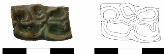
Figure 5. This is a lower jaw molar of a donkey (Basket No. 60130) from the EBA III/Karum Period.

A lower jaw molar (Basket No. 60130) from the EBA III/Karum Period has been identified as belonging to a donkey. This conclusion is based on features such as the absence of penetration of the buccal fold into the so-called “ neck ”, nearly symmetrical rounded double knots, and a shallow “ V ” shape lingual fold (Figure 5) (compare Johnstone 2004: Figure 4.3b and Table 4.1).