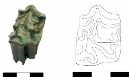
Figure 3. An upper molar from the Early EBA III Period, belonging to a donkey (Basket No. 70141).

A maxillary molar (Basket No. 70141) from the Early EBA III Period has been identified as belonging to a donkey. This identification is based on the typical features of the molar, including the absence of “ pli caballin ”, a simple fossette fold, and a small symmetrical protocone (Figure 3) (compare Johnstone 2004: Figure 4.3e and Table 4.1).