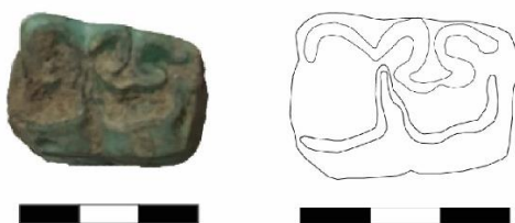
Figure 4. A lower jaw molar of a mule (Basket No. 8493) from the Late Early Bronze Age III Period.

A lower jaw molar (Basket No. 8493) from the Late EBA III Period is classified as a mule, particularly due to the deep penetration of the buccal fold into the so-called “ neck ” (Figure 4) (compare Johnstone 2004: Figure 4.3c and Table 4.1).