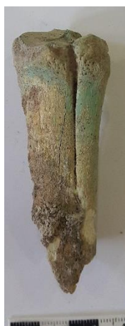
Figure 7. A pathological lesion was found on a mule’s metatarsal bone (Basket No. 60021) from the EBA III/Karum Period.

Splints, primarily involving the interosseous ligament between metacarpal bones, can cause periostitis, leading to the formation of new bone (exostoses). Factors contributing to this reaction include trauma, strain from excessive training, faulty conformation, imbalanced nutrition, or improper shoeing, particularly in immature horses [47,48].