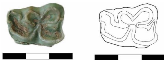
Figure 6. A lower jaw molar of a mule (Basket No. 60074) from the EBA III/Karum Period.

the buccal fold into the so-called “neck” (Figure 6) (compare Johnstone 2004: Figure 4.3c and Table 4.1).