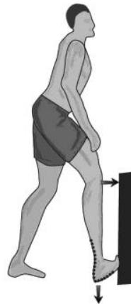
Figure 3. Calf muscle stretching exercise 2.