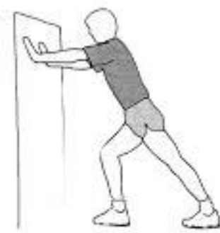
Figure 2. Calf muscle stretching exercise 1.

In accordance with the literature, stretching analytical technique was used [15] to perform the adjunctive five sessions of stretching of the calf muscles (Figures 2 and 3). The duration of the stretching session (showed in Table 1) was defined on the basis of clinical evidence [14,22], as described in Table 1. The activity was performed under the supervision of a physiotherapist in order to guarantee the maintenance of correct body arrangement. Two exercises were alternated during the period.