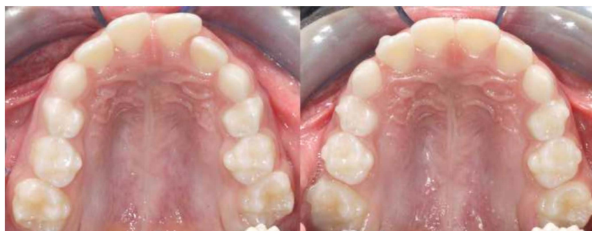
Figure 3. Intraoral occlusal evaluation pre-treatment (T1) and post-treatment (T2).

derotation observed was of about six degrees. Giuntini et al. [8] reported that in the case of extreme mesial rotation of the upper permanent molar, i.e., when the molar is included in the dental arch perimeter with its oblique diameter instead of its mesiodistal diameter, maximal molar derotation leads to a corresponding maximal gain of space of about 2.5 mm. According to our results, orthodontic molar derotation (about six degrees) led to a mean gain of arch space of about 1 mm. Our findings agree with Braun et al. [12], who reported a value of gain in arch perimeter of 2.5 mm with an upper molar derotation of about 20 degrees. It is important to emphasize that the gain in arch perimeter following molar derotation occurred anteriorly to the derotated tooth, as the buccal cusps moved distally by about 1 mm, with a simultaneous improvement in the molar occlusal relationship.