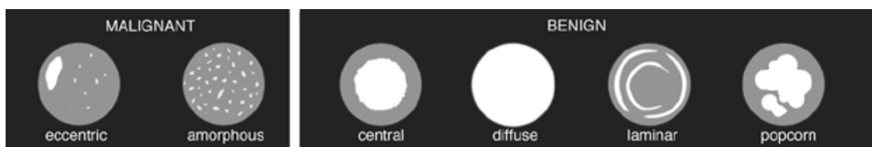
Figure 2. Schematic representation of calcifications

larly lepidic predominant adenocarcinoma (LPA) characterized by slow tumor growth.