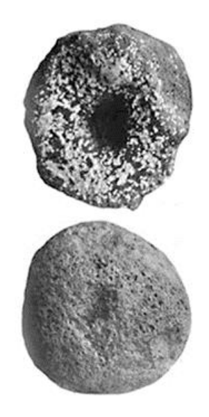
Figure 5. Unusual pitted anvils, ( top ) FLK North-1, Olduvai Gorge, 1.8 million years ago. ( bottom ) FLK North Sandy Conglomerate, Bed II, around 1.6 million years ago.

by percussion to yield an "exaggerated pit". If the second and fourth alternatives were supported, the artifact would constitute a "cupule" petroglyph and also might be classed as an exotic tool.