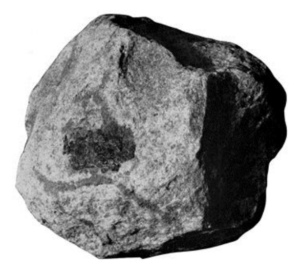
Figure 2. Subspheroid with apparent dot-and-undulating-line motif framed in hexagon shape, MNK Main, Olduvai Gorge, around 1.5 million years ago (reproduced with permission from Cambridge University Press, Mary Leakey 1971).

The mineralogy of this artifact needs identification and its lithic classification reconsidered based on more recent studies critiquing Leakey's "subspheroid" category (Mora 2005; de la Torre 2009–2010) [72,85]. In addition to its unusual weight and size dimensions, I observe that it has on its surface apparent natural markings, a dot and an undulating line. These marks need to be re-examined to determine to what extent they are natural, the result of intact or eroded mineral inclusion or some sort of applied pigment. The marks appear framed by the hexagonal shape around the circumference of the object. Research is needed to determine if the hexagon shape is natural, the accidental by-product of battering or the result of intentionally removing six flakes, thus forming the hexagonal shape, or some combination of these alternatives. If verified as non-utilitarian, intentional working of the stone, this would be a second example of Oldowan palaeoart, a geometric artifact with a glyph-like motif, and the pattern of marking motifs could be compared to the "cupule and undulating line" petroglyph made from the Acheulian or Oldowan level in Auditorium Cave, Bhimbetka, India, noted above.