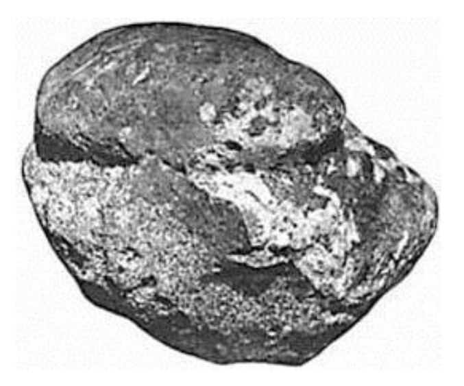
Figure 1. Grooved and pecked cobble, FLK North-1, Olduvai Gorge, 1.8 million years ago (reproduced with permission from Cambridge University Press, Mary Leakey 1971).

As well as being an archaeologist, Mary Leakey was an accomplished archeological illustrator. She provides (84) a detailed visual analysis of the artifact. It is a phonolite cobblestone (79 \times 54 \times 49 \text{ mm}) with almost the entire original cortex removed by pecking and battering. Its form is oblong, the base and one side flat, the upper surface and opposite side convex; one end blunt, the opposite end obliquely pointed. On its upper surface an artificial, well-marked groove varies from 9 to 18 mm in depth and encircles a raised oval area, measuring 60 \times 41 mm, which is pecked over its entire surface. The groove is continuous except for an area 20 mm wide, which subsequently scaled off, and a 9 mm wide area on the opposite side where part of the cortex remains. "There is no evidence of wear inside the