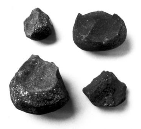
Figure 3. Four core choppers, FxJj1, Koobi Fora, around 1.9 million years ago. Top-right, "broken core" with rhomboid shape after four cortical flake removals.

This artifact was classified as a "broken/irregular chopper" on a basalt pebble. The Koobi Fora Museum cast of the core shows more clearly the symmetrical rhomboid shape that emerged "inside" the core following four bifacial flake removals (Figure 4).