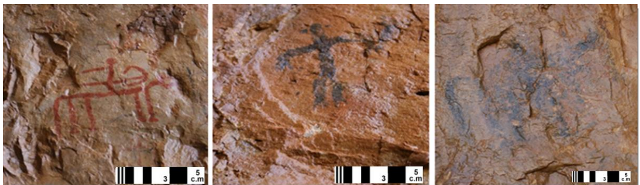
Figure 5. “Anthropomorphic” motif, “Horse rider” and foot in Shamsali Rock shelter.