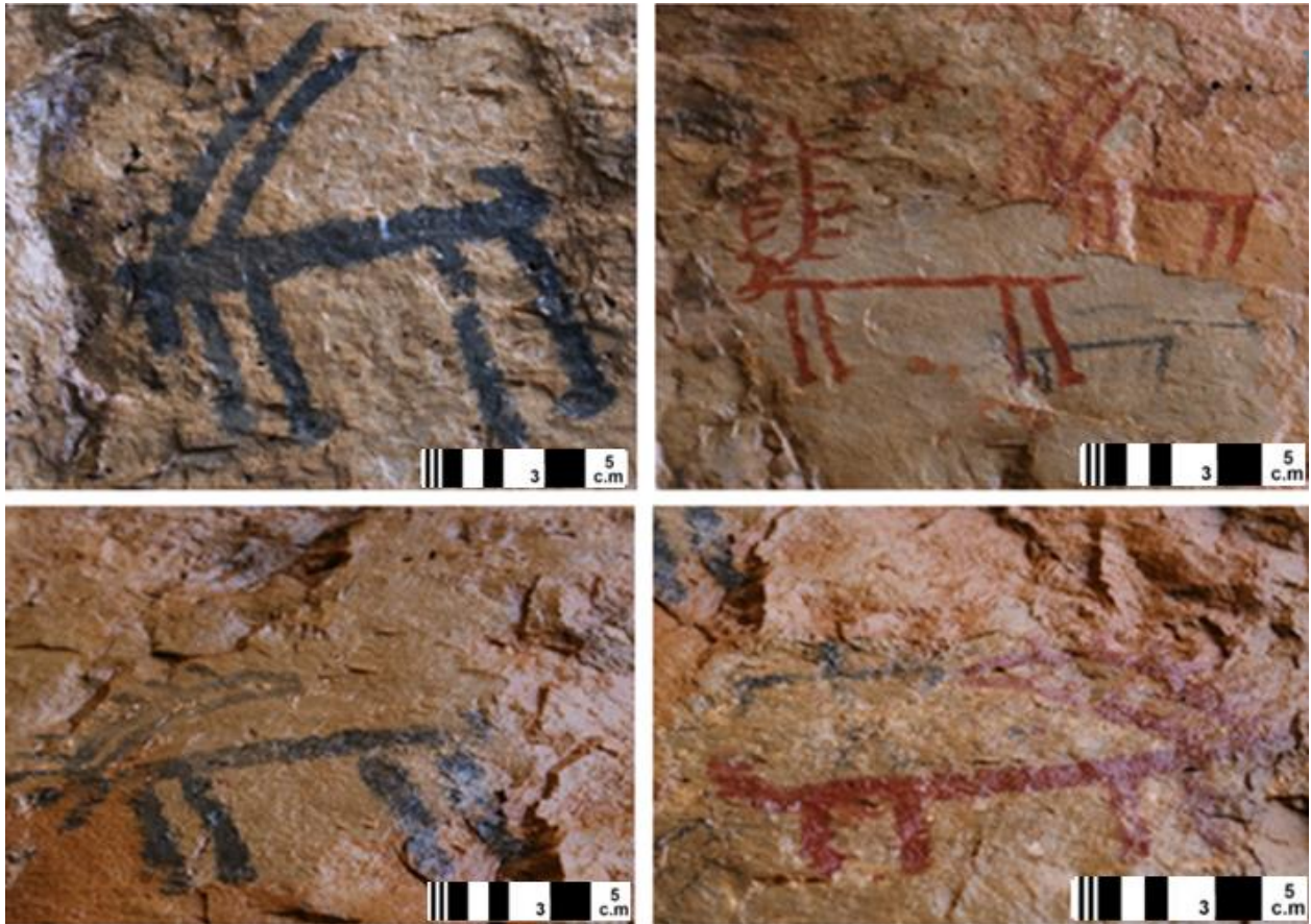
Figure 4. “Ibex” with long and curved or jag horns motifs in the Shamsali Rock shelter.