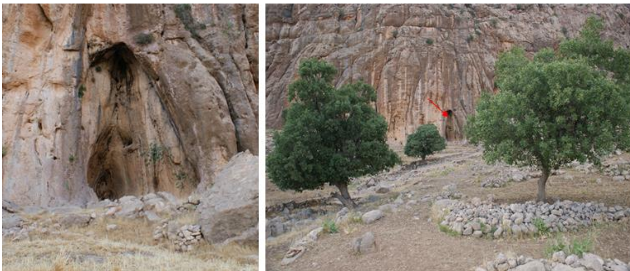
Figure 2. View of the Shamsali Rock shelter located 150 m northwest of Kamak Nadali Village.