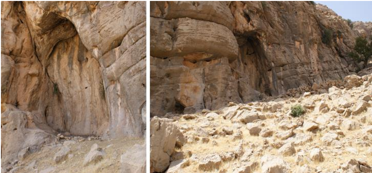
Figure 6. View of Eshkaft-e-Gorgali.

7). Among the most important destructions of the reliefs are paginations; some of them are covered in paled sediment formation, and memories written in charcoal.