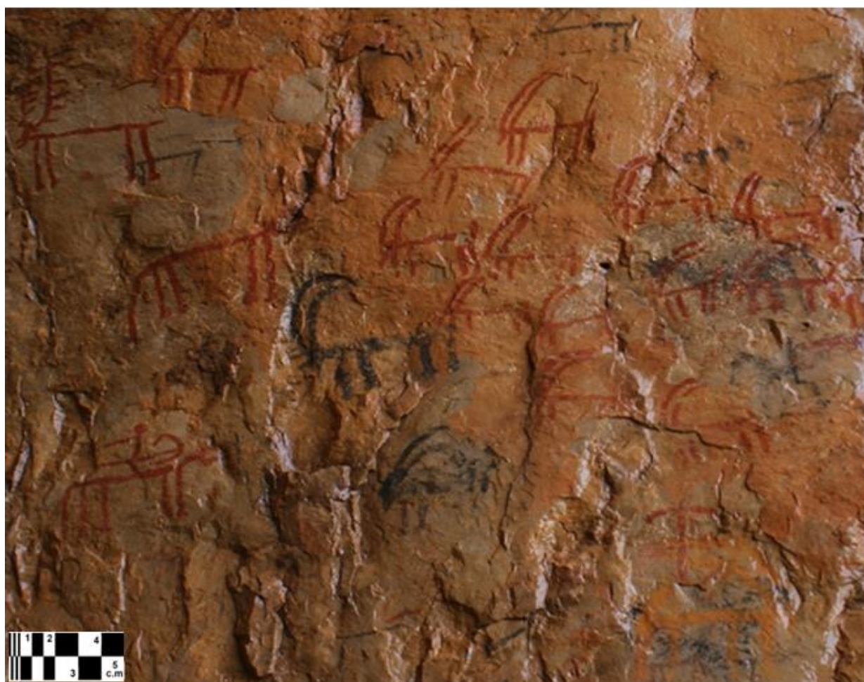
Figure 3. The main group of Pictograms in the Shamsali Rock shelter.