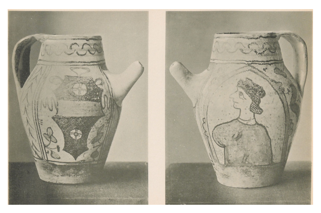
Figure 1. Photograph provided by Wilhelm von Bode for the photo volumes ( Abbildungen aus dem Archiv des Verbandes von Museumsbeamten. Dritte Folge 1910), an apothecary jug in the style of the 14th–15th century. Scan by Kunstbibliothek Berlin, used by permission.

Albert Museum contributed also, among a larger disclosure on terracotta (Verzeichnis der im Archiv des Museen-Verbandes bewahrter Abbildungen falscher Altsachen n.d., Nr. 101–107).