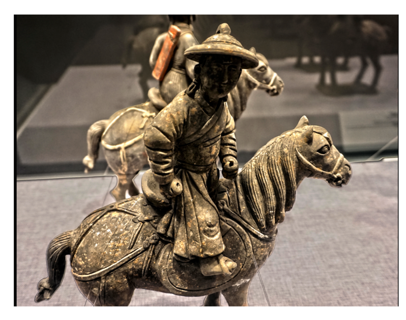
Figure 8. Front view (with reflected back) of a ceramic figure of a postal courier unearthed from Xiadian Village, Chang'an District, Xi'an, Shaanxi Province, China. Yuan dynasty. H. 37.5 cm, l. 32 cm. Collection of the Shaanxi Provincial Institute of Archaeology.