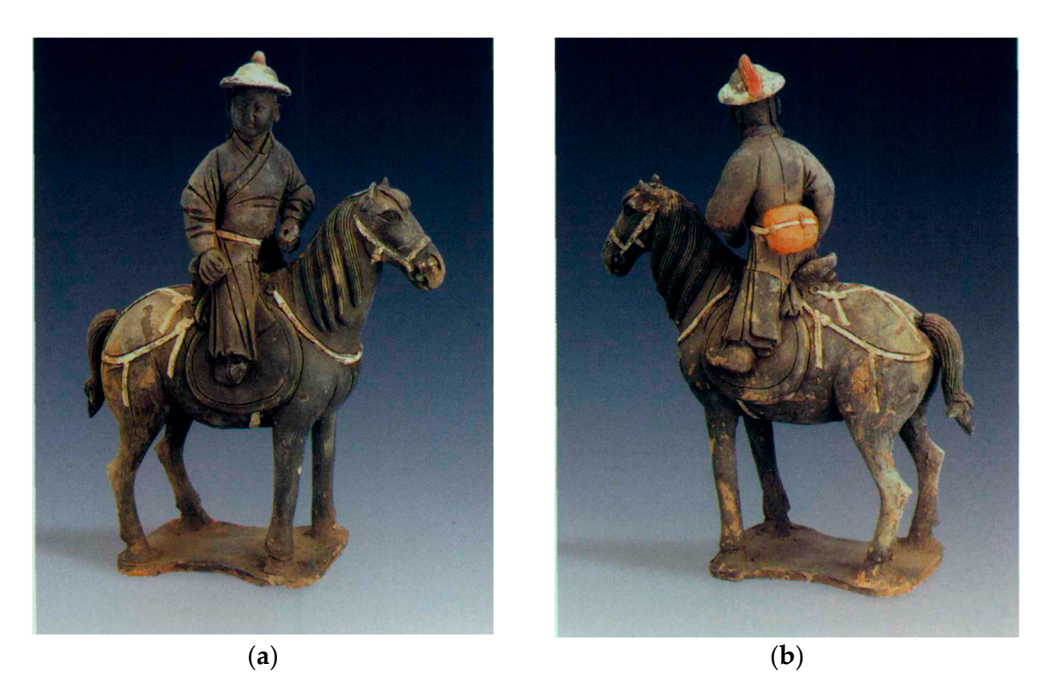
Figure 2. (a,b) Front and back views of painted ceramic equestrian figures from the Tomb of Wang Shiying (d. 1305) and his wife, née Xiao (d. 1315), which were discovered in 2005 near Xi'an, Shaanxi Provice, China. Yuan dynasty ca. 1315. H. 36.8 cm, L. 31 cm. After Xi'an shi wenwu baohu kaogu su Figures 4 and 5.