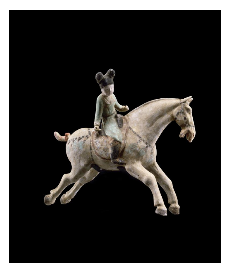
Figure 4. Young woman polo player. Tang Dynasty, first half of the 8th century. Painted unglazed ceramic. Musée Guimet. MA 6117.