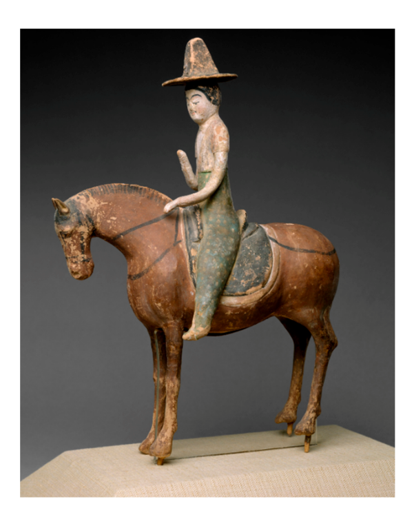
Figure 3. Horse and female rider. Tang dynasty (618–907), 7th century. Astana cemetery, Xinjiang province, China. Unfired clay with pigment. H. 36.2 cm, L. 29.2 cm. Metropolitan Museum of Art, New York, Fletcher Fund, 1951 accession number 51.93a, b.