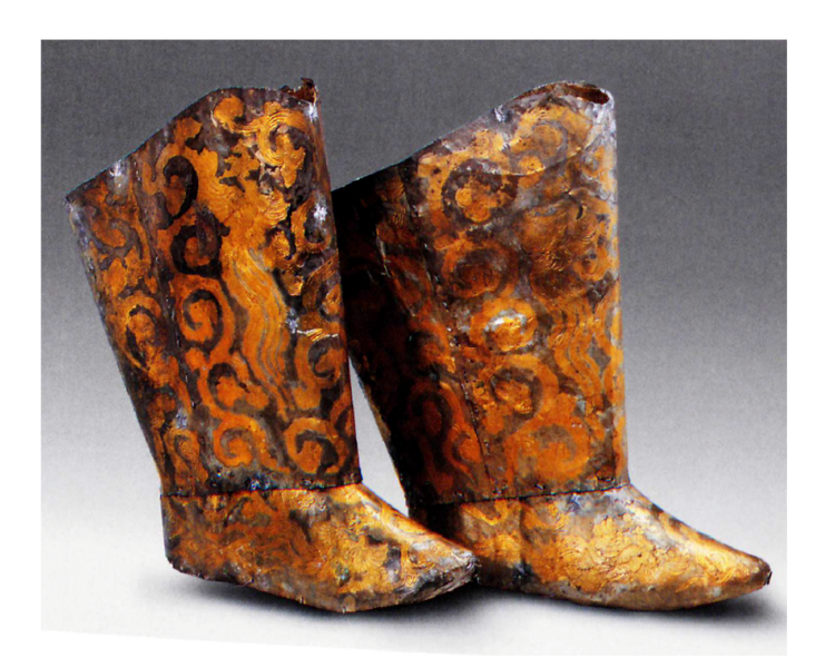
Figure 7. Pair of boots, tomb of Princess of Chen and Xiao Shaoju, Qinglongshan, Naiman Banner, Inner Mongolia. Liao dynasty, ca.1018. Gilded silver, L. 29.2 cm, H. 37.5 cm. Research Institute of Cultural Relics and Archaeology of Inner Mongolia. After Kinoshita 2006, cat. 4.

(Pearson et al. 2019, p. 58). As with the Yemaotai burial, the deceased seems to have been interred with favored objects she used in life. Unlike the Princess of Chen and Yemaotai burials, which date from the Liao imperial period, the woman in the Üzüür Gyalan burial lived in Mongolia prior to the confederation of groups by Chinggis Khan and the subsequent establishment of the Mongol Empire. In other words, she did not live in an imperial system. The objects in her tomb are of good quality, but none are made of expensive materials such as gold or silver, and many of the garments and other textiles show that they were worn and repaired (Pearson et al. 2019, p. 58). The horse interred with the deceased was likely a favored one she rode in life (Pearson et al. 2019, p. 58). The horse buried with the tomb occupant parallels the favored polo donkeys interred with Madame Cui in Tang Chang'an mentioned above, although the context is quite different. The Üzüür Gyalan burial features a favored horse that the deceased rode to do daily tasks, while the polo donkeys in Madame Cui's tomb are among many luxury possessions that give us insight into the leisure activities of the deceased. As for hunting, while horse riding was an important activity for the woman buried in Üzüür Gyalan, none of the burial objects found in her tomb indicate that she was a hunter.