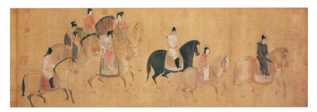
Figure 5. Song Dynasty copy (by Song Emperor Huizong?) of Tang origin attributed to Zhang Xuan (713–755), Lady Guoguo's Spring Outing . Hand scroll, ink and colors on silk. 52 \times 148 cm. Liaoning Provincial Museum.