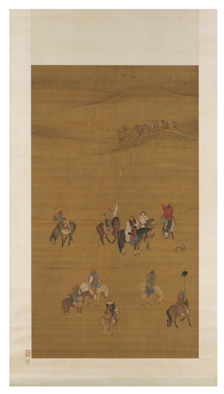
Figure 6. Liu Guandao (active ca. 1275–1300). Kubilai Khan Hunting , dated 1280. Hanging scroll, ink and color on silk. 182.9 \text{ cm} \times 104.1 \text{ cm} .

This paper approaches women's roles in the hunt in the Liao and Yuan dynasties together for several reasons. First, the Kitan and the Mongols were nomadic groups originating from present-day Mongolia for whom horse riding was an essential part of daily life, and as such, they share certain cultural characteristics. In addition, when the Kitan established the Liao, pre-imperial Mongol groups lived contemporaneously with the Liao dynasty in parts of Mongolia, and the material evidence from different places in north China and Mongolia provides useful comparisons. Finally, the Liao provided an important precedent for Yuan rule in China, impacting everything from the societal structure to dress (Morgan 1982, p. 129; Shea 2020, pp. 13, 22–31, 42). Although the Liao dynasty in China fell to the Jurchen Jin in 1125, members of the ruling Yelü family fled to Central Asia under the leadership of Yelü Dashi, where they established the Qara Khitai, or Western Liao. The Qara Khitai did not fall until the Mongol conquests in that region in 1218, and