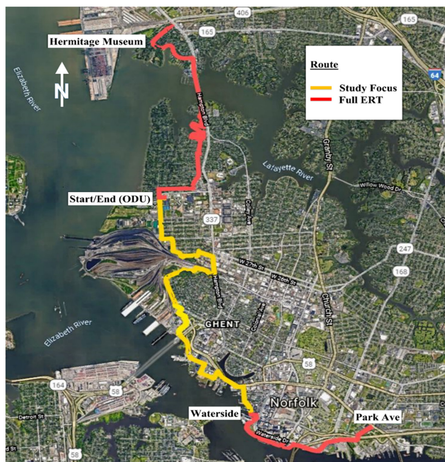
Figure 1. Map of the Elizabeth River Trail with data collection section. Note: Original graphic created using Google Maps.