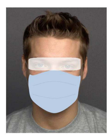
Figure 2. Areas of interest in our eye tracking experiment: eyes (white coloring) and face mask (blue coloring). The depicted face shows model 066_y_m from the MPI FACES database [86].

the stimuli and collect and analyze the eye movement data (Tobii Technology, Stockholm, Sweden). Statistical analysis of the eye-tracking data was based on the 2000 ms presentation period of the face stimuli. Two areas of interest (AOI) were defined for each face: the eye region and the surface of the face mask. The AOI for the eye region was created around the eyes and above the face mask (see for an example Figure 2).