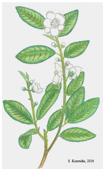
Figure 1. Drawing of the Camellia sinensis plant.

black tea has far fewer active catechins than green tea [1,2,5,8]. Green tea contains four main catechins: (–)-epicatechin (EC), (–)-epigallocatechin (EGC), (–)-epicatechin-3-gallate (ECG), and (–)-epigallocatechin-3-gallate (EGCG). The most abundant of these in green tea is EGCG, which represents around 59% of total catechins. The next most abundant is EGC (around 19%), then ECG (around 14%), and EC (around 6%) [2,3,8]. Figure 2 shows a representation of green tea catechin composition.