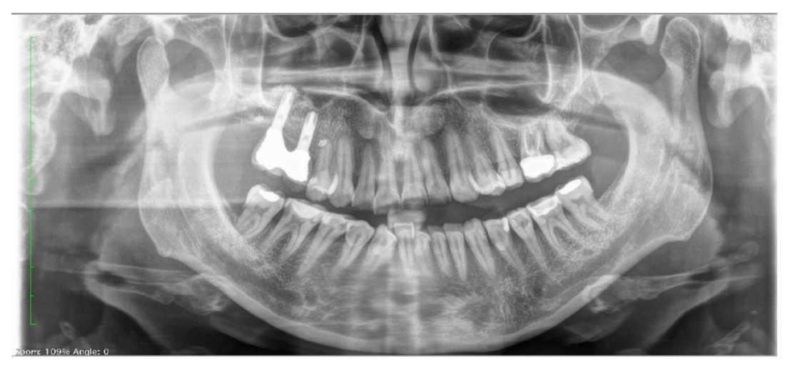
Figure 4. Pretreatment panoramic radiograph.

Clinical and radiographic examinations revealed a good status of the periodontal tissue (Figures 4 and 5).