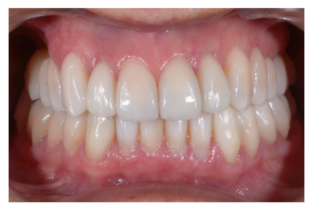
Figure 15. Clinical follow-up at 24 months.