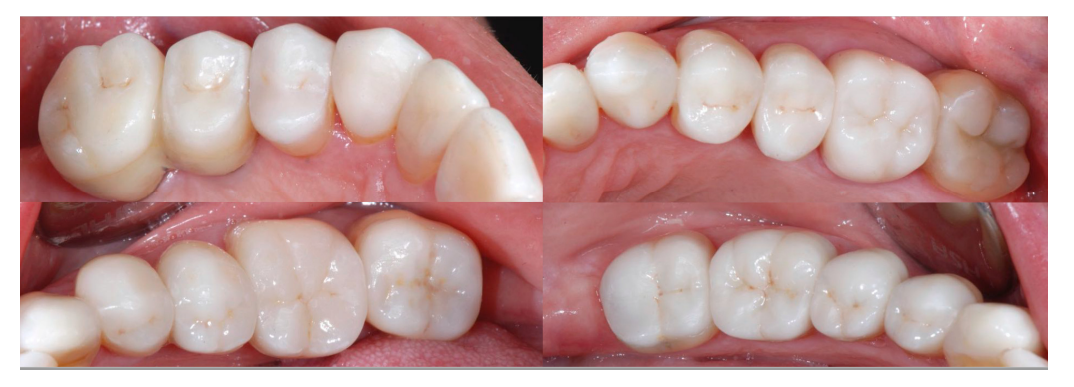
Figure 13. Details of posterior quadrant reconstruction with recovery of the vertical dimension, chewing efficiency, and aesthetics.

The correct execution of the orthodontic-conservative procedure allowed us to achieve, with excellent approximation, all the planned goals (Figure 14). Stability of outcome was confirmed by a clinical and radiographical follow-up at 2 years after the finish of therapy (Figures 15 and 16).