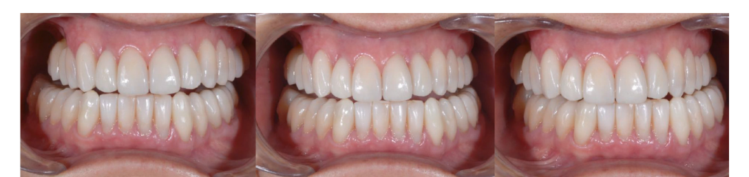
Figure 12. Physiological occlusal dynamics in protrusion and lateral movements.