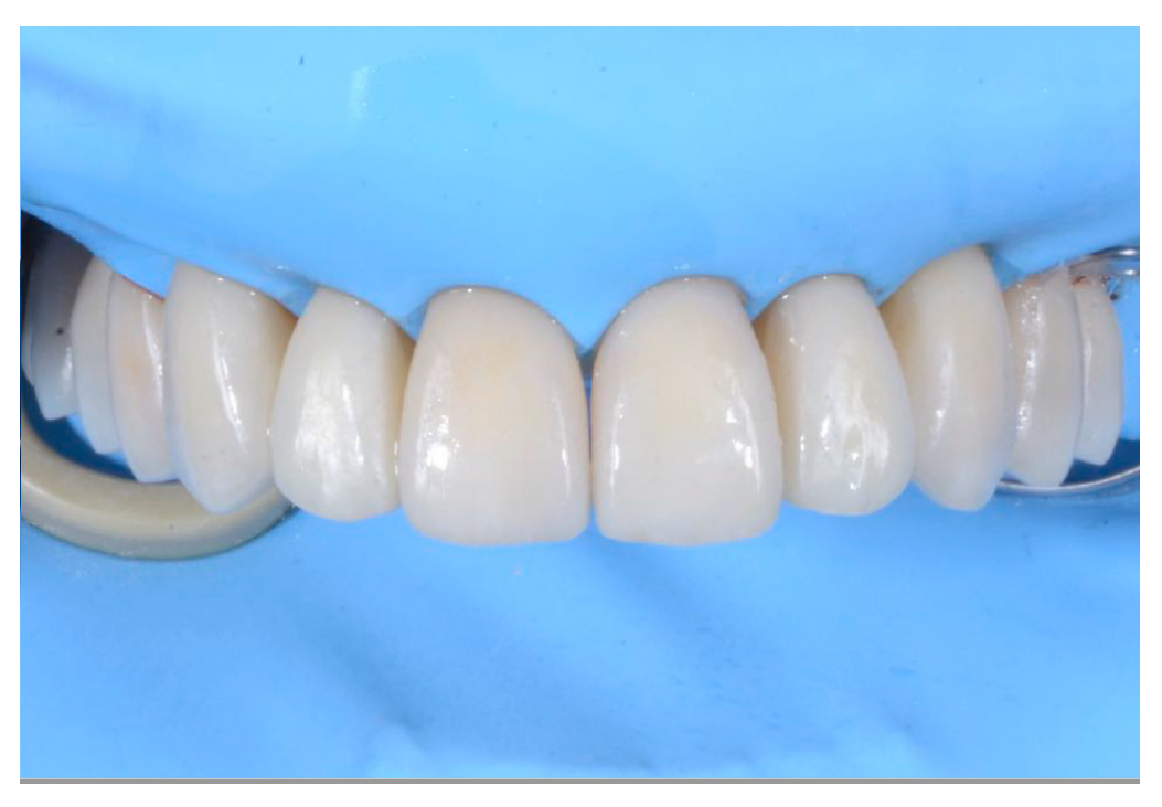
Figure 10. Adhesive cementation of prosthetic artifacts (overlays, onlays, and veneers) using an adhesive technique, dry field.

fundamental importance, in order to be evaluated according to the needs of the individual patient, favoring an attitude as conservative as possible. If the technique has been correctly performed in each step, the exact correspondence with the functionalized mock-up will be verified (Figure 10).