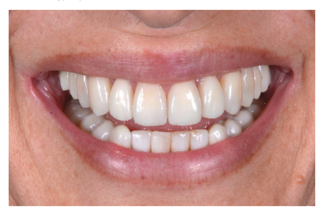
Figure 14. Details of posterior quadrant reconstruction with recovery of the vertical dimension, chewing efficiency, and aesthetics.

The correct execution of the orthodontic-conservative procedure allowed us to achieve, with excellent approximation, all the planned goals (Figure 14). Stability of outcome was confirmed by a clinical and radiographical follow-up at 2 years after the finish of therapy (Figures 15 and 16).