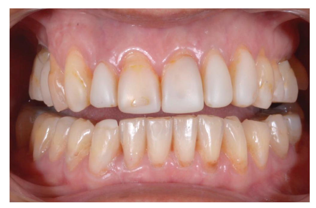
Figure 9. Result after 6 months of aligners.

Prosthetic finalization (Step V): This phase involves the aesthetic and functional reconstruction of the arches through the placement of definitive restorations by employing adhesive techniques. The choice of materials for reconstruction is a point of