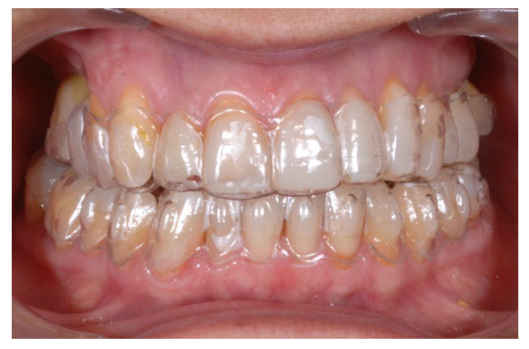
Figure 8. Orthodontic treatment with customized aligners based on the mock-up.

Set-up and orthodontics (Steps III-IV): The orthodontic step is the next step after mock-up creation and the creation of a clinical validity of vertical dimension elevation. Each new aligner will exert different pressure on individual teeth, programmed with the digital set-up. It will be the clinician's job to perform stripping and occlusal retouching of the mock-up to allow the teeth to move in the predetermined direction and amount (Figure 8). After 6 months of aligners, the goals of orthodontic treatment have been achieved, and the case is ready for finalization (Figure 9).