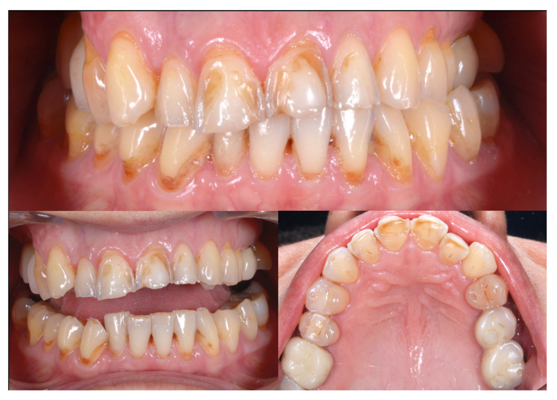
Figure 1. Intra-oral photos showing the extensive erosion of the frontal teeth.

A 54-year-old man came to the dental clinic reporting functional and aesthetic complications in relation to the numerous erosive lesions present in the upper and lower arch (Figure 1). At the clinical examination, the patient's dentition showed extensive erosions at the palatal surfaces of the frontal elements and wear on the occlusal surface of the posterior sectors, resulting in loss of vertical dimension and tilting of the occlusal plane to the right. In addition, posterior cross bite and misalignment of the anterior sector were present in the upper arch, while in the lower arch, there was anterior crowding. Moreover, incongruous conservative and prosthetic treatments were visible at the occlusal surface of the posterior sectors (Figure 2). It was also observed that occlusal changes that occurred because of the extensive tooth erosions compromised the physiological occlusal dynamics in protrusion and lateral movements (Figure 3).