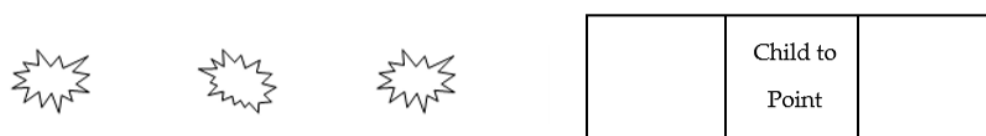
Figure 1. Example of 'Odd One Out' Card and Response Card.

This training task (adapted from Odd One Out Span [54]) focused on the child's visuospatial EWM and was based on the Odd One Out task. A different set of odd-one-out stimuli to the outcome assessment materials was used to eliminate practice effects and overlap. The task was presented with paper-based materials, rather than on a tablet computer, but otherwise had the same format as the Odd One Out task. Odd-one-out stimuli were each presented as black-and-white line drawings on 10 cm × 30 cm white cards. The response card depicted one or more blank horizontal grids, each containing three empty boxes. The child was asked to remember the spatial location of the 'odd one out' items by pointing to the correct position/s on the grid (see Figure 1 for examples).