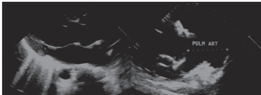
Figure 1. On the left long-axis parasternal view demonstrating aortic aneurysm; on the right parasternal short-axis that shows pulmonary artery aneurysm.