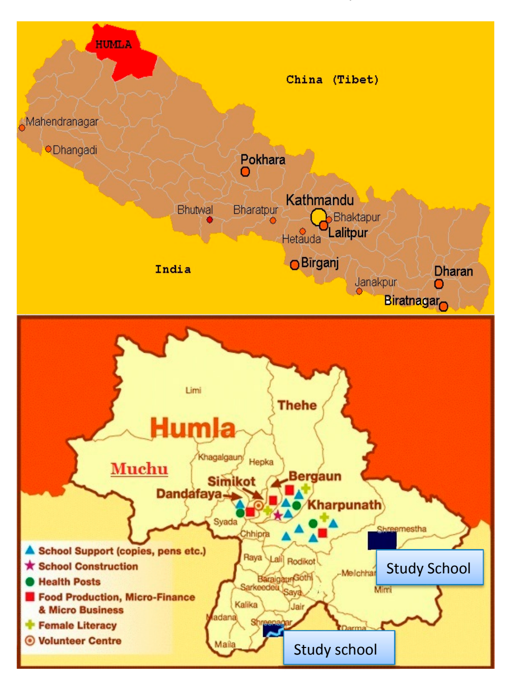
Figure 1. Area of study.

The study was a cross-sectional study based on elementary schools in the Humla district of Nepal. Humla was selected purposively as it represents the remote area of Nepal and other countries also, as shown in Figure 1 [38]. Two elementary schools (Shreenagar and Srimasta) were randomly selected and all children available at the schools were included in this study.