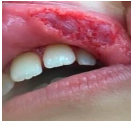
Figure 2. 14-year-old female patient, with a large wound on her upper lip, non-bleeding area of 1 \times 2 cm on the non-keratinized mucosa, surrounded by erythema that did not involve the vermilion border.