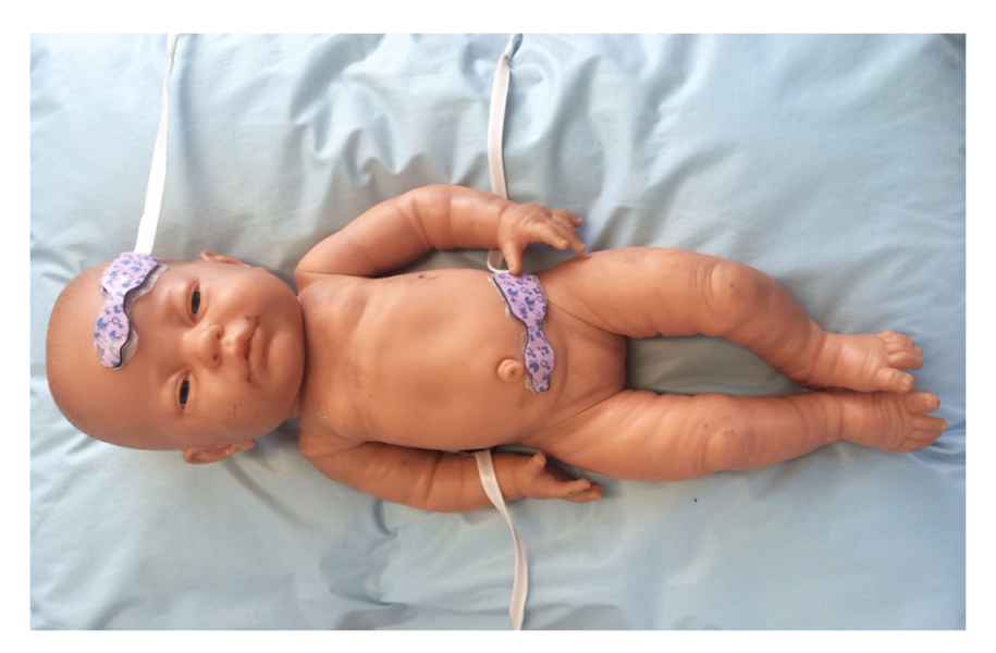
Figure 1. Near-Infrared Spectroscopy (NIRS) technology for assessment of mesenteric perfusion.

The study was divided into 4 intervals: Period 0-30 min before the bolus feeding, Period 1-30 min after the bolus feeding, Period 2-30 min before the continuous feeding, and Period 3-30 min after the continuous feeding. For each period, the average SaO<sub>2</sub>, rSO<sub>2</sub>S, and FOES values were calculated.