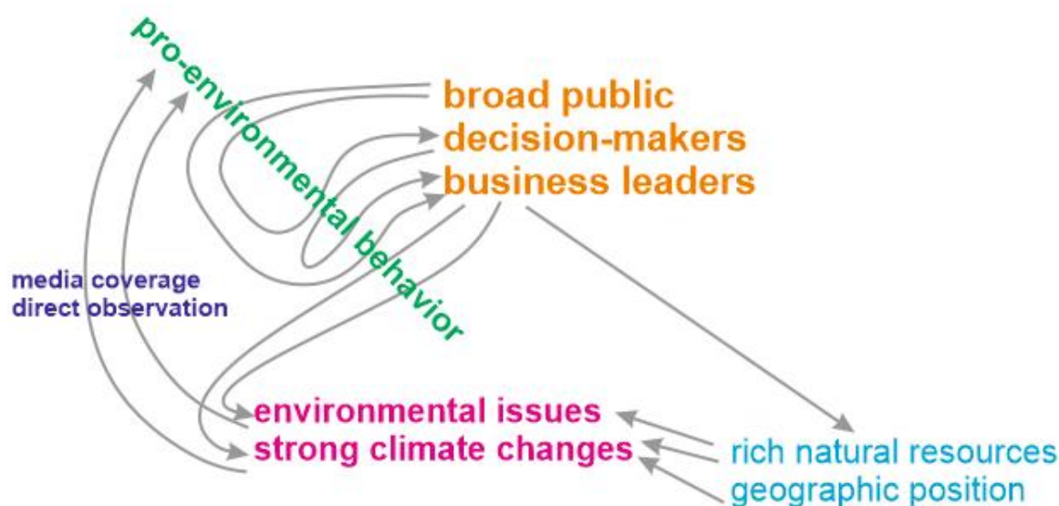
Figure 1. Conceptualization of some influence and feedback relevant to pro-environmental behavior.