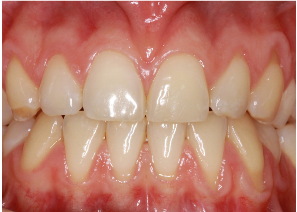
Figure 2. Clinical example illustrating the variability of the gingival phenotype depending on the dental sector concerned (thick in the maxillary anterior sector and thin in the mandibular anterior sector).

Cigarette smoking and a gummy smile appear to be associated with a thicker gingival phenotype. With regard to smoking, this relationship could be explained by the phenomenon of reactive fibrosis that affects the gingival chorion of smokers. However, it is not possible to link this trend to a dose or time effect of smoking, as the number of studies devoted to this issue is too small [16,24].