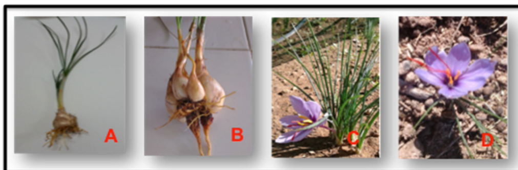
Figure 1. Crocus sativus plant morphology: (A) saffron plant; (B) types of roots in saffron; (C) saffron leaves; (D) saffron flower.

The flowers of Crocus sativus begin to appear at the beginning of autumn, towards the end of September of purple color composed of six tepals, three are internal, whereas the three others are external, which meet at the long tube that arises from the upper part of the ovary (Figure 1C). At their appearance, the flowers are protected by whitish membranous bracts. The pistil is composed of an inferior ovary from which a thin style, 9 to 10 cm long, arises. The style ends with a single stigma composed of three filaments of intense red color whose length exceeds that of the tepals, which are the part of the plant interesting for the man from the point of view of culture [14].