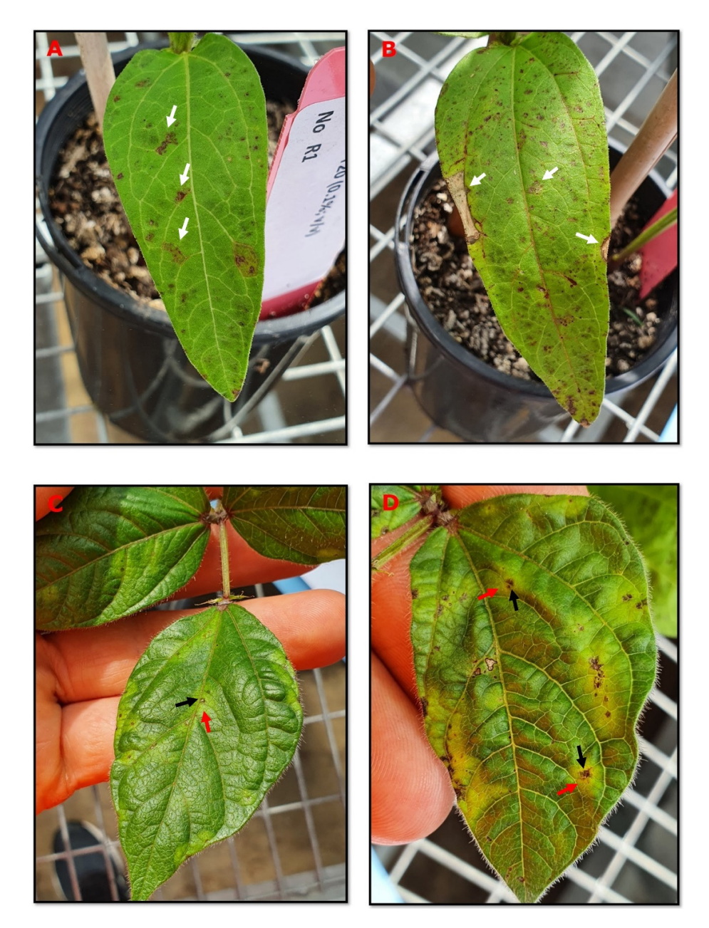
Figure 1. Examples of mungbean leaves, cultivar Berken, showing halo blight symptoms. On the cotyledons, symptoms initially appear as irregular shaped spots scattered throughout the tissue (( A ) picture collected 6 days after inoculation). These can join, causing large, irregular-shaped chlorotic lesions (( B ) picture collected 12 days after inoculation). On the trifoliate leaves, initial symptoms appear as regular-shaped, water-soaked circular spots surrounded by large chlorotic margins (( C ) picture collected 6 days after inoculation). These develop large necrotic lesions by about 12 days after inoculation ( D ). White arrows in A and B indicate the presence of chlorotic tissues. Black and red arrows in C and D indicate the presence of necrotic and water-soaked lesions, respectively.

rain and hail; these are thought to trigger a widespread pathogenic shift [2]. Therefore, movement of equipment through and between paddocks should be carefully considered, as symptomless mungbeans can harbour the pathogen. Mechanical damage and physical movement may spread the disease across the paddocks [3]. Growers and agronomists should implement a 'come clean-go clean' approach, which has proven successful in many other crops such as cotton [4]. Vehicles and machineries should be properly cleaned before leaving one paddock so that they arrive clean at the next paddock.