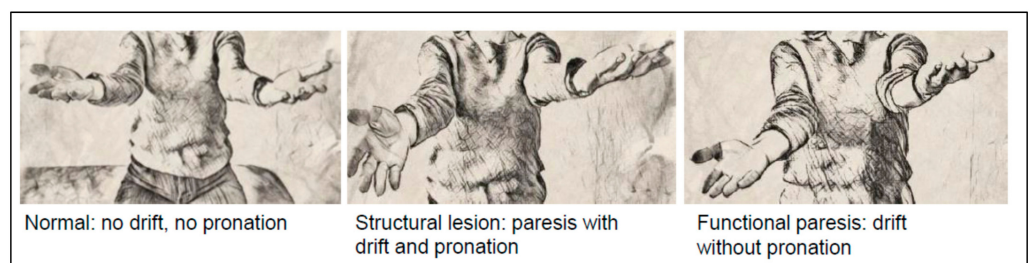
Figure 2. Functional drift without pronation as a clinical positive sign for FND.

During follow-up visits, focused neurological exam and clinical positive signs are documented. If a functional movement disorder is present, the Simplified Functional Movement Disorders Rating Scale (S-FMDRS) is executed as a follow-up parameter. In functional non-epileptic seizures, the frequency of seizures (seizures per week or month) is documented.