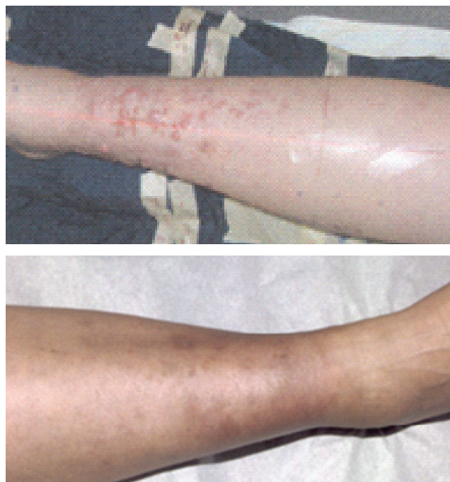
FIGURE 2 Radiation treatment of cutaneous myelomatous lesions. On the top, the myelomatous lesions before radiation treatment. On the bottom, the patient's leg 1 month after completing treatment.

Unfortunately, the lesions recurred at cutaneous sites not included in the initial radiation field, including the right foot, left ankle, right breast, left orbit,