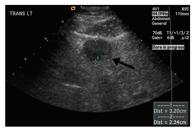
FIGURE 1 Screening ultrasonography shows a 3.2-cm hypoechoic mass (arrow) along the hepatic capsule.

A solid 3.2-cm mass arising from the anterior right lobe of the liver was discovered during routine ultrasonography screening (Figure 1), together with fatty infiltration of the liver. The mass was hypoechoic and showed faint vascularity on both