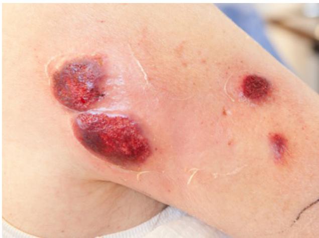
FIGURE 1 Cutaneous lesions at the site of azacitidine injection demonstrating purplish plaques with a central flaccid bulla and a maximal diameter of five centimetres.

In our case, the most likely cause of PG was considered to be azacitidine. First, the temporal relationship between the introduction of the drug and the development of lesions at the injection sites is suggestive of an adverse drug reaction. Second, alternative causes of PG were considered less likely. Transformation to AML, infection, contamination of the drug vial, and inadequate injection technique were ruled out. However, a paraneoplastic phenomenon secondary to MDS cannot be completely excluded. Nonetheless, it was considered less likely because of the localization of the lesions at the sites of injection of azacitidine. An additional contribution of a pathergy phenomenon at the sites of subcutaneous injection is possible but is unlikely to be