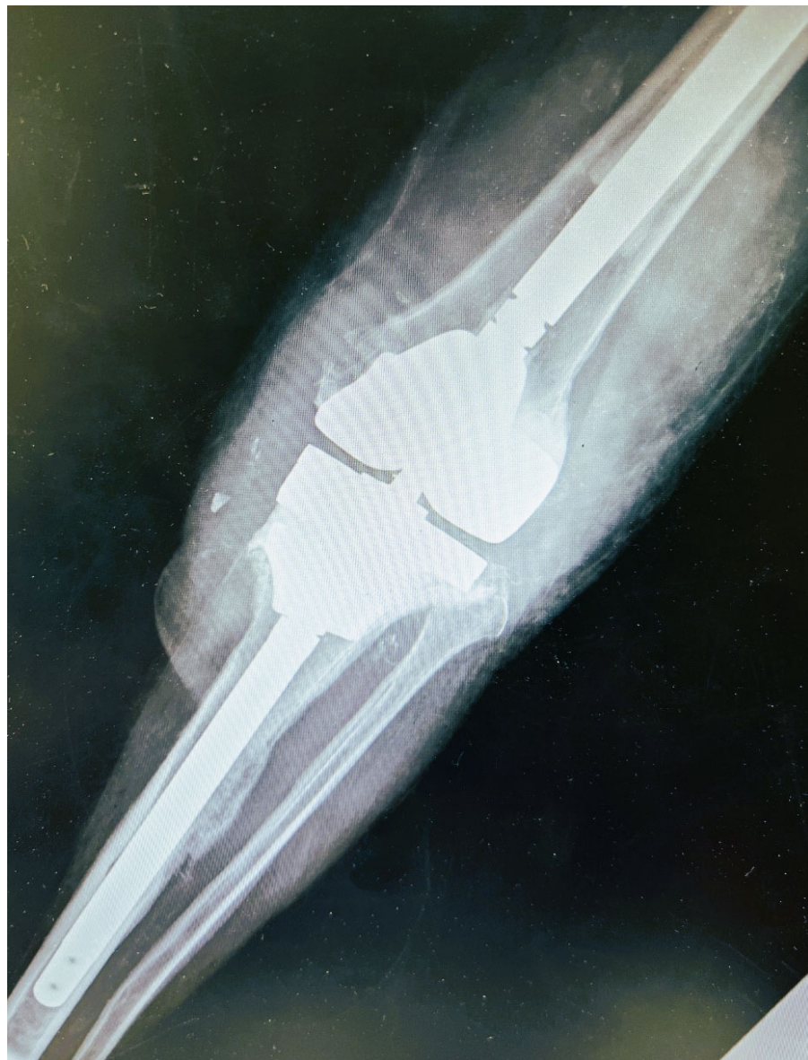
Figure 2. Post-operative anteroposterior X-ray view. A constrained prosthesis with long femoral and tibia stems was placed. A tantalum porous scaffold was placed in the proximal tibia due to bone loss, while augments supported the femoral and tibia components.

The second stage of the revision surgery was performed six months after the initial resection arthroplasty and spacer cement placement. A constrained prosthesis with long femoral and tibia stems was placed. A tantalum porous scaffold was placed in the proximal tibia due to bone loss, while augments supported the femoral and tibia components due to osseous deficits (Figure 2). The patient had an uneventful recovery. Two years following the final reconstruction joint surgery, the patient is fine with no signs or symptoms of PJI, while flexion of the knee has reached 90 degrees.