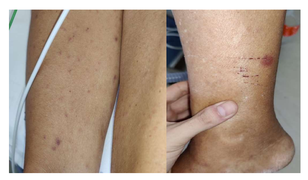
Figure 1. Rickettsial rash with spots which then turn into petechiae.

When she was transferred to our infectious and tropical diseases ward, she had asthenia, fever (38 °C), tachycardia (about 120 beats per minute), and tachypnea (breaths 26 per minute) with respiratory failure. Maculo-papular rash and tick bite were found at the physical examination (Figure 1).