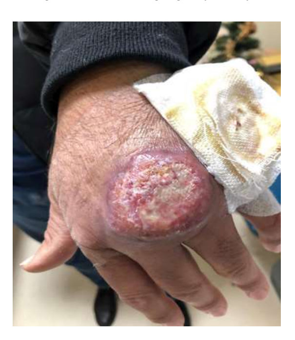
Figure 4. Red thickening of the skin (papule) typical of cutaneous leishmaniasis, which slowly enlarges and ulcerates.

Case Report #5: We report a case of a 52-year-old male patient (Figure 4), who presented a papule on the back of the hand that was present for about two years. The skin lesion was initially small and hyperemic, then progressively increased in size, and a well-defined and painless open ulceration, with a raised reddish border appeared. After several non-diagnostic biopsies, he was admitted to our day-hospital service in September 2020, in which scraping of the cutaneous lesion was performed, demonstrating the parasite ( L. infantum species ). In addition, serology ( Leishmania IgG) was positive. An HIV test was negative and protein electrophoresis showed a monoclonal gammopathy. Physical examination failed to demonstrate enlarged lymph nodes. Abdominal ultrasound was also performed, excluding splenomegaly. The lesion was >1 cm, so the patient took a test dose of liposomal amphotericin B without side effects and was subsequently admitted to the ward, where he was successfully treated with intravenous liposomal amphotericin B (dosing schedule was 3 mg/kg/day on days 1–5, 14, and 21 with a total dose of 21 mg/kg).