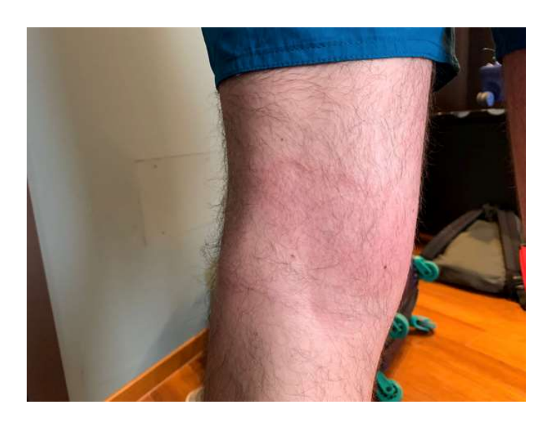
Figure 3. Red macula typical of Lyme disease in a patient.

Case Report #4: A 31-year-old male patient reported an insect bite which occurred in August 2022 while staying in a wooded area. After a few days, he noted the appearance of a macular rash in the popliteal cavity, which became bigger in the following days (Figure 3).